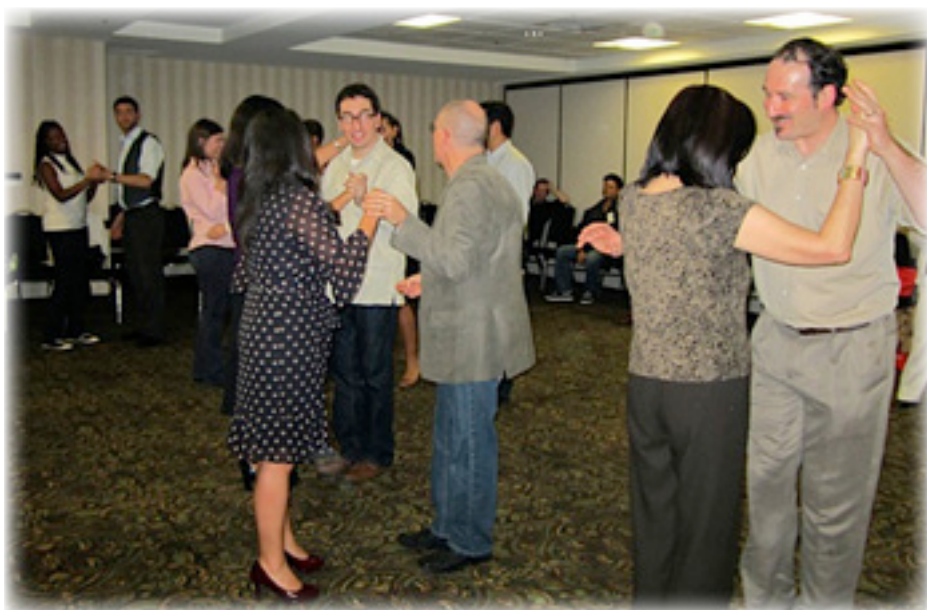
SEM 2012 Workshop on Danzón.

For the annual SEM meetings, LACSEM organizes and sponsors