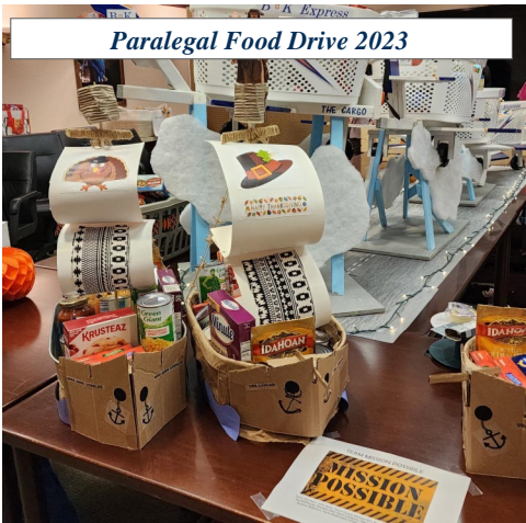
Paralegal Food Drive 2023