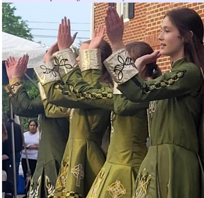
Dancers from the Doyle School of Irish Dance