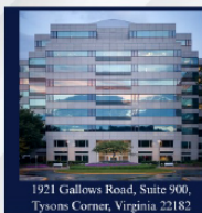
1921 Gallows Road, Suite 900, Tysons Corner, Virginia 22182

As of early May, our team has expanded into the entire 9th floor of the Tysons Corner office. This exciting milestone highlights our continued growth across all practice areas. With this new space, we're better equipped than ever to serve our clients and community with the high-quality, personalized legal services they deserve. We look forward to welcoming clients, colleagues, and friends as we continue to grow together.