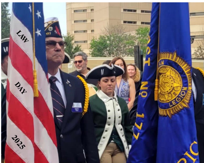
Presentation of the Colors