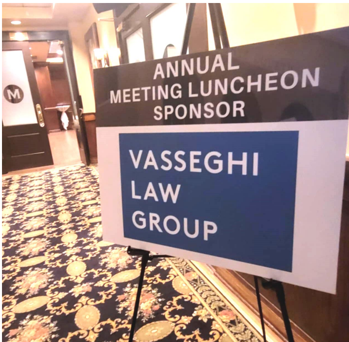
Thank You Vasseghi Law Group!