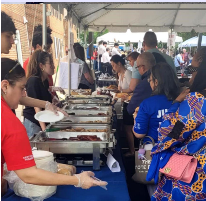
Fairfax County legal community celebrating Law Day 2025