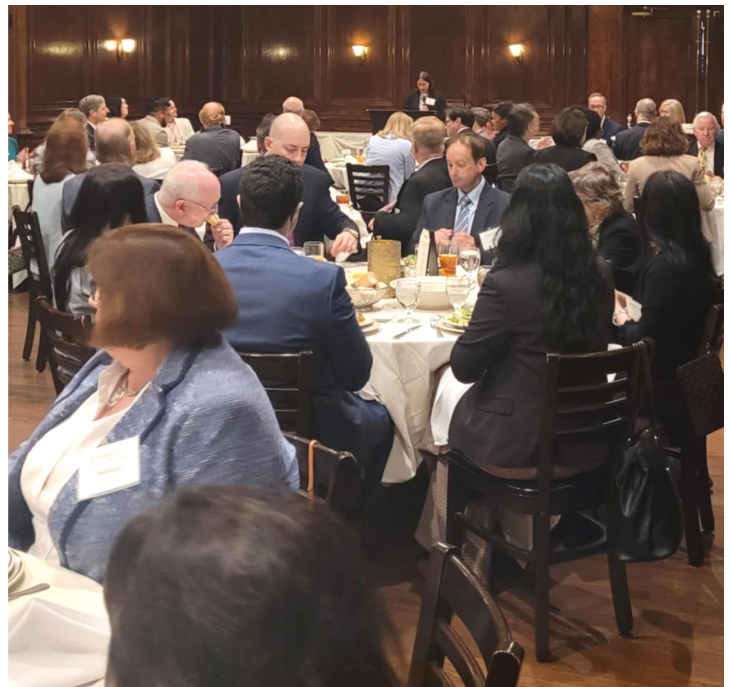
Members of the Bar Enjoying Lunch at Maggiano's Little Italy