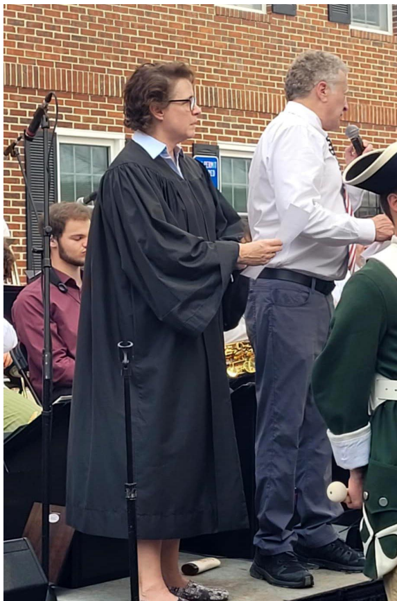
Chief Judge of the Fairfax County Circuit Court, The Hon. Penney Azcarate, leading members of the Bar in the reaffirmation of their legal oaths