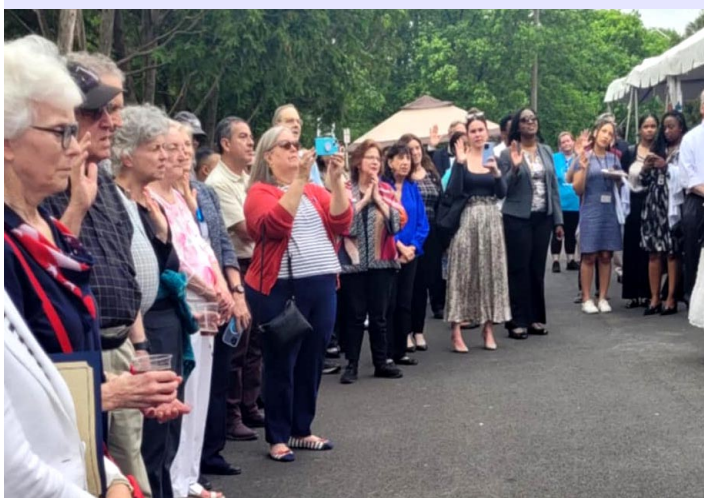
Members of the Bar reaffirm their oath to uphold the rule of law in Fairfax County