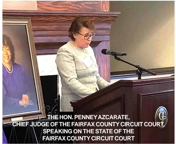
THE HON. PENNEY AZCARATE, CHIEF JUDGE OF THE FAIRFAX COUNTY CIRCUIT COURT SPEAKING ON THE STATE OF THE FAIRFAX COUNTY CIRCUIT COURT