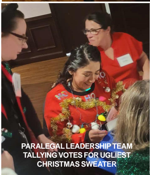
PARALEGAL LEADERSHIP TEAM TALLYING VOTES FOR UGLIEST CHRISTMAS SWEATER