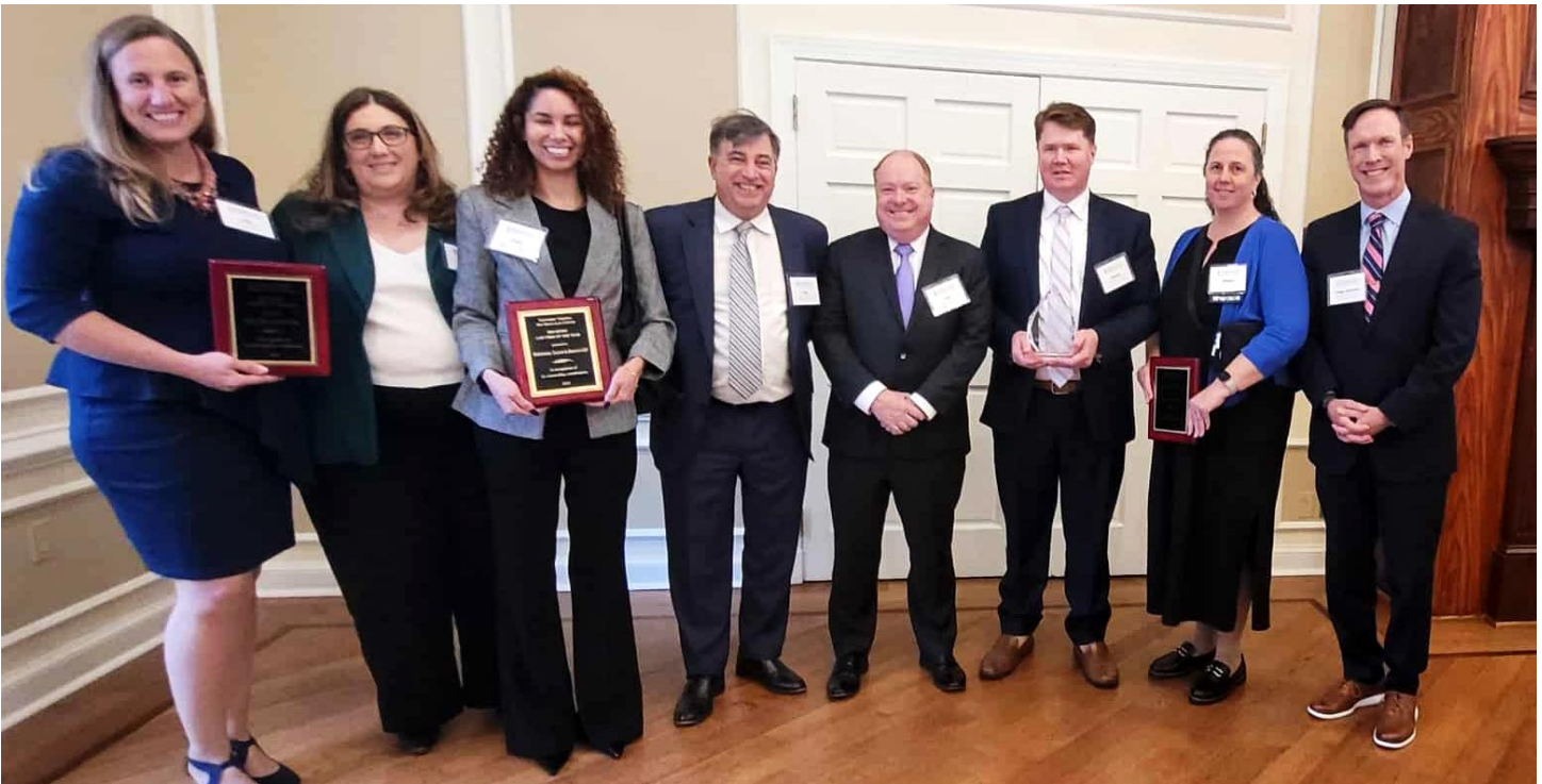
PRO BONO AWARD RECIPIENTS WITH THE HON. STEPHEN C. SHANNON