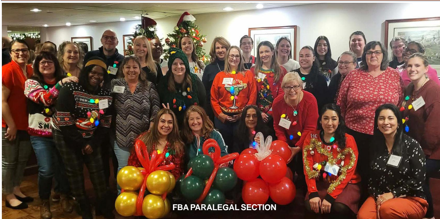
FBA PARALEGAL SECTION