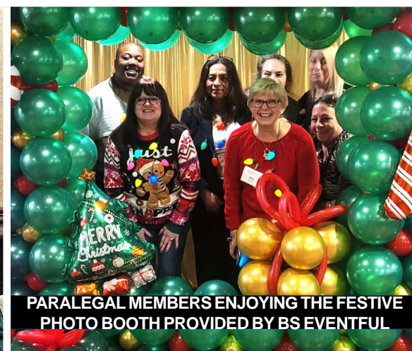
PARALEGAL MEMBERS ENJOYING THE FESTIVE PHOTO BOOTH PROVIDED BY BS EVENTFUL