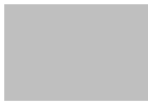
Half Page (7.5" x 4.75")