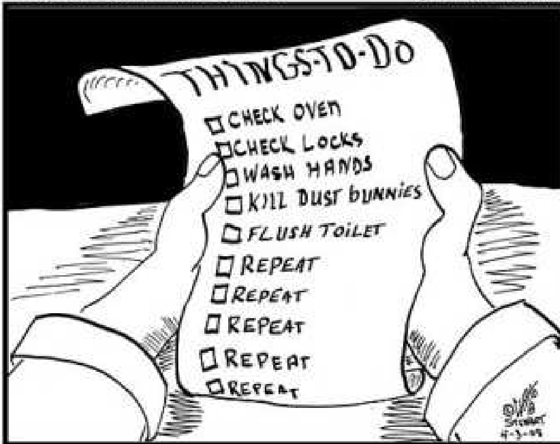
Obsessive-Compulsive Disorder To Do List