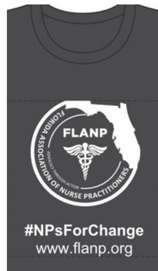
FLANP T-Shirt $10