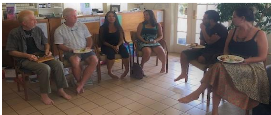
HSCA meets on Kauai in Lihue, July 14, 2018

HI State Chiropractic Association P.O. Box 22668 Honolulu, HI 96823-2668 Ph: (808) 926-8883 Fx: (808) 926-8884 www.HawaiiStateChiropracticAssociation.org