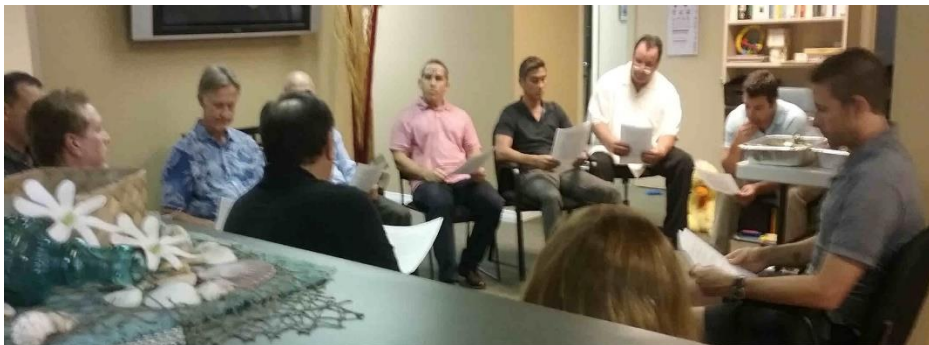
HSCA meets on Big Island in Kona, May 24, 2018