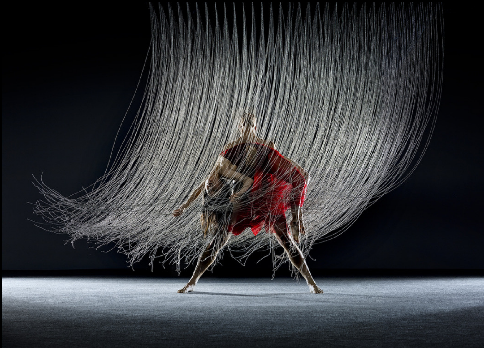
Robert Moses' KIN