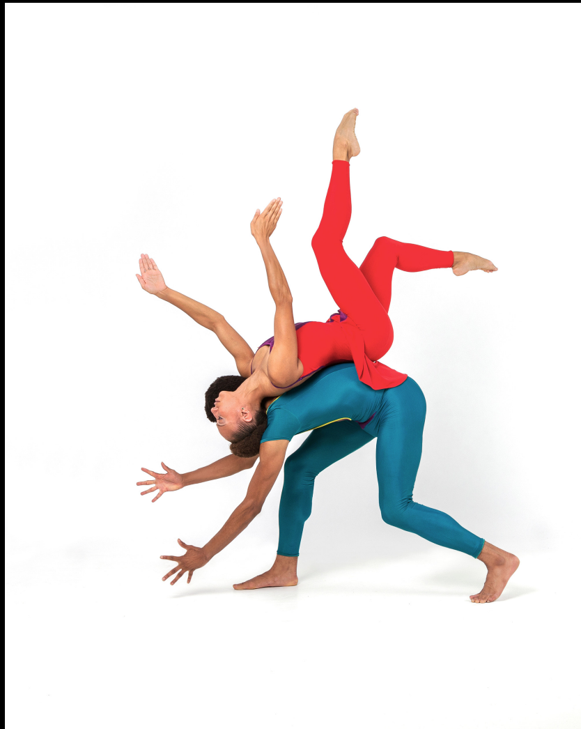
PHILADANCO! A Philadelphia Dance Company