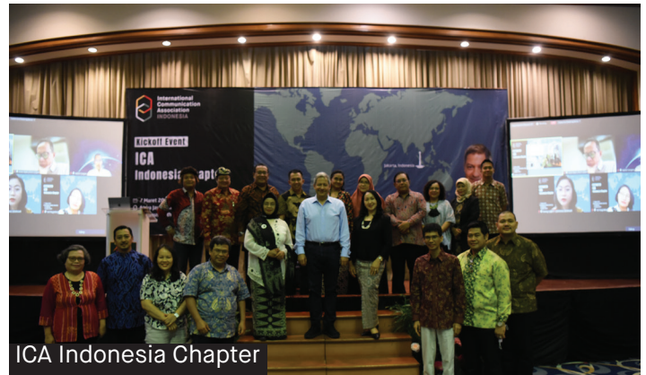
ICA Indonesia Chapter