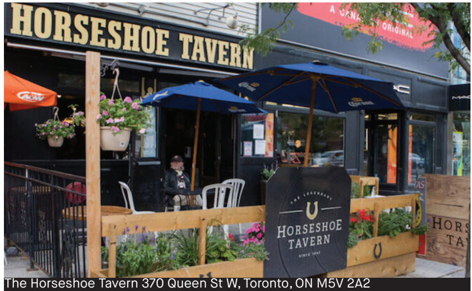
The Horseshoe Tavern 370 Queen St W, Toronto, ON M5V 2A2

The Poetry Jazz Cafe is a cozy live jazz venue located in the center of the Kensington Market neighborhood. The venue hosts many of Toronto's up and coming jazz musicians, which you can enjoy