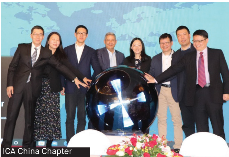
ICA China Chapter