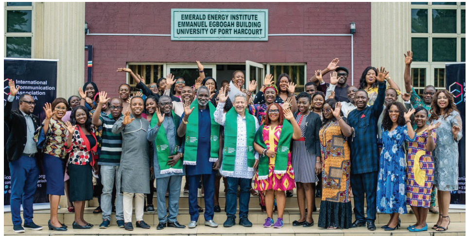
ICA Nigeria Chapter