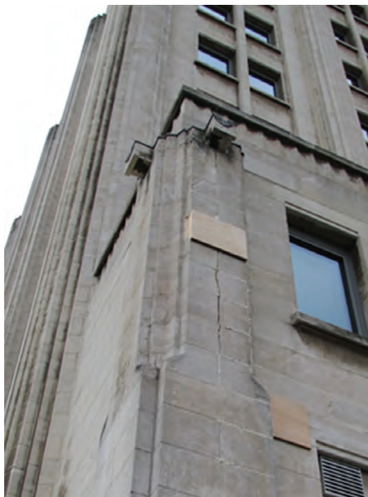
Fig. 3: Vertical cracking at column

Cathodic protection has been successfully used to mitigate steel frame corrosion in historic structures for approximately 15 years in the United Kingdom. When using cathodic protection, conventional repair occurs only in areas with corrosion-damaged stone and the remaining stone stays in place with the structure being protected by embedded impressed current anodes. This means that cathodic protection can limit the inconvenience, cost, and potential damage caused by conventional repair methodologies.