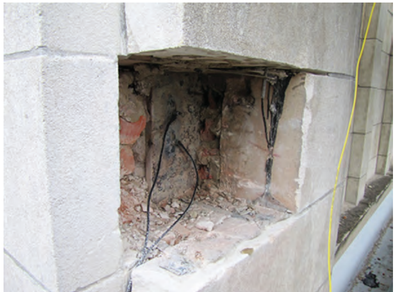
Fig. 11: Cathode connections to steel column