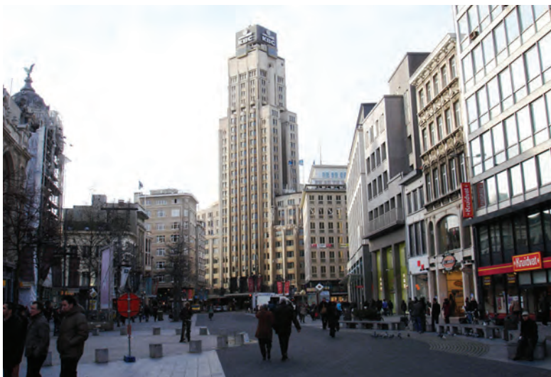
Fig. 2: The Boerentoren (KBC Tower) in Antwerp, Belgium

A plan was developed to build a modern skyscraper in the medieval city center which, when completed at 287 ft (87.5 m) high, would be the tallest in Europe. The Art Deco-style building (Fig. 1) would house the offices of Krediet Bank and became known as the Boerentoren (Farmer's Tower) in honor of the bank's most important shareholders. Today, the building is officially known as the KBC Tower and is occupied by the largest bank of Flanders (Fig. 2).