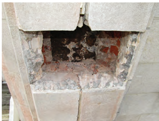
Fig. 4: Brick infill around steel column

Based on the investigation, various areas of the structure were categorized based on their condition (refer to Table 1 and Fig. 5).