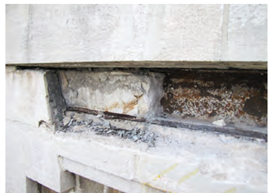
Fig. 6: Beam corrosion above window

tion (ICCP), whereby the electrical current is provided by an external power source connected to a long-lasting inert anode. A voltage is created such