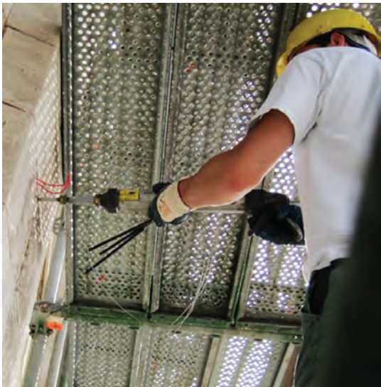
Fig. 13: Conductive anode grout placement