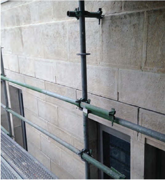
Fig. 12: Joints saw cut and holes drilled for anodes and associated wiring

The ICCP system should be regularly monitored and adjusted to assure that adequate protection exists. After the system was commissioned, testing and adjustments were conducted after 2, 4, 8, and 12 weeks. Thereafter, depolarization testing was conducted quarterly and a visual inspection and report due annually.