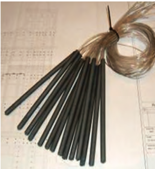
Fig. 10: Ceramic titanium dioxide ICCP anodes