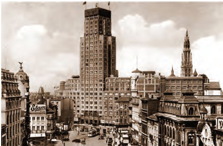
Fig. 1: The Boerentoren building in the 1930s

W ith the World Exposition coming to Antwerp in 1930 to celebrate the establishment of the Belgian Kingdom in 1830, the mayor wished to showcase Antwerp on the European stage.