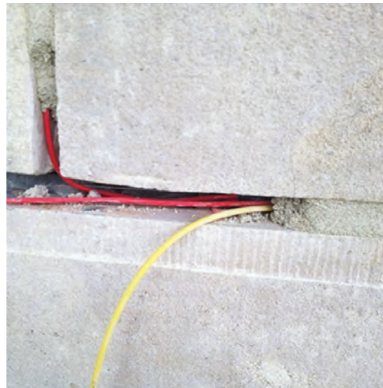
Fig. 15: Wiring concealed in the mortar joint