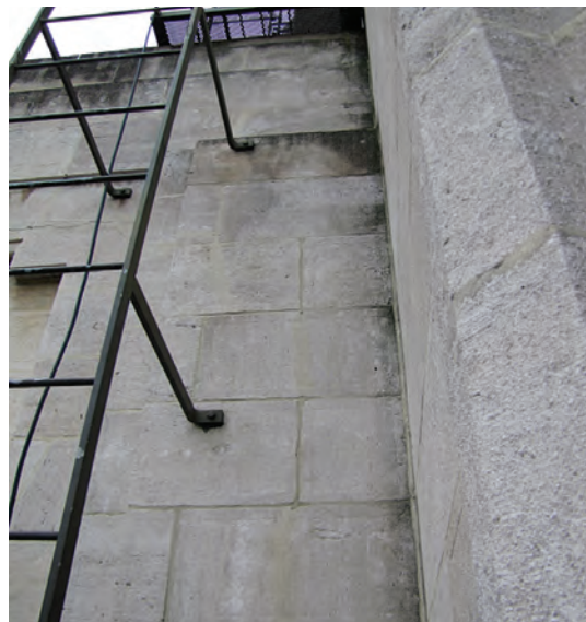
Fig. 16: Anodes and wires concealed