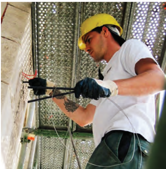
Fig. 14: Conductive titanium dioxide ICCP anode placement