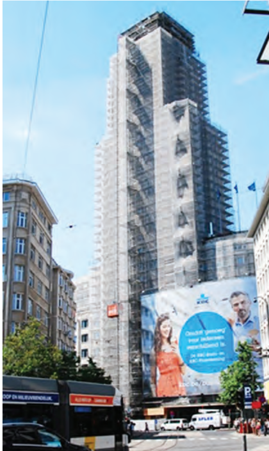
Fig. 9: Scaffolding at building façade

Implementation of the façade repair program occurred from March to December 2014. The scope of work included scaffolding the building for access (Fig. 9), light general cleaning while retaining existing patina, repair/replacing stone cladding affected by corrosion, moss-repellent treatment, concrete repairs, new sealant around