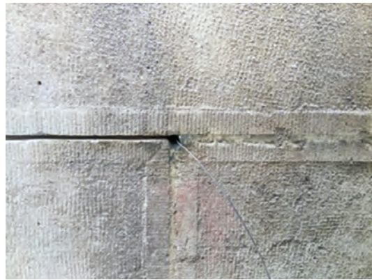
Fig. 7: Discrete anode in masonry joint

The pilot installation proved the feasibility of cathodic protection as a solution to the façade corrosion problem and a specific, final design was prepared. Discrete ICCP anodes were selected to minimize the risk of near shorts to the anchors and allow for easier resealing of the joints versus tita-