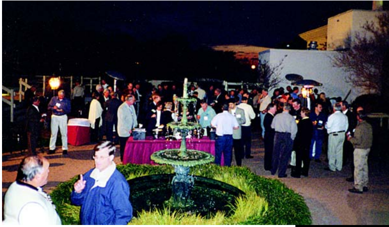
Convention attendees enjoying the weather at the opening reception