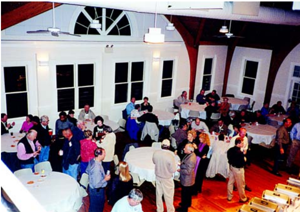
Carolinas Chapter Lowcountry Boil at the Colonel Robert L. McCormick Beach House at the Citadel