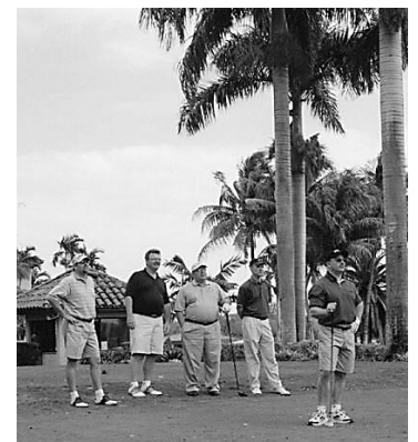
The networking and fellowship carry onto the golf course