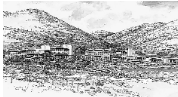
Artist rendering of the new JW Marriott Starr Pass

Do not forget that IHEA committees will meet on Thursday during the annual meeting. Join the many members that have already registered and do not miss this excellent program assembled by your Program Planning Committee. Please review the Schedule of Events on the opposite page and visit our website at www.ihea.org to register today.