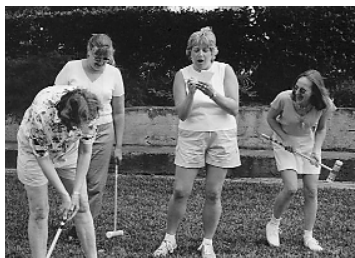
The annual croquet tournament will return this year