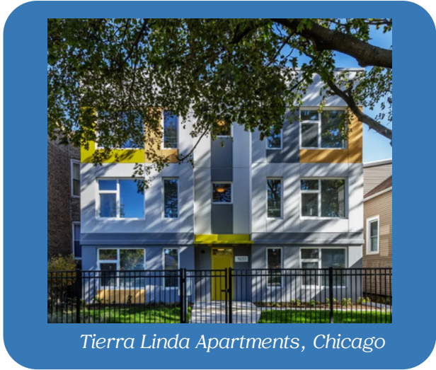
Tierra Linda Apartments, Chicago