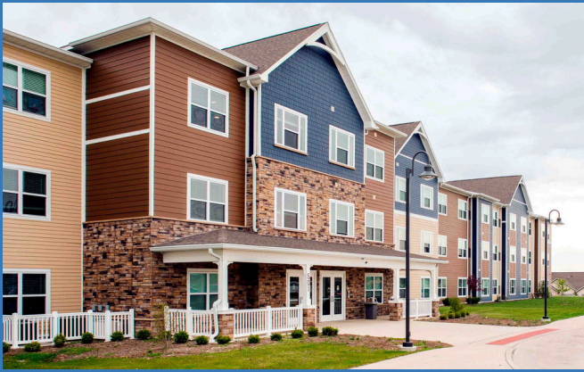
The Haven at Marketplace, Champaign

“The IAHTC program has proven itself to be a critical part of the financing structure of almost all of our Illinois transactions for many years. The states that have their own state tax credit program are effective in using the federal resources available for affordable housing much more than the ones who do not. This kind of leveraging is very impactful, and allows many deals to move forward.”