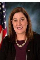
Senator Jil Tracy (R) 47th District

Springfield Office: 103C Capitol Building Springfield, IL 62706 (217) 782-2479 District Office: 3701 East Lake Center Drive Suite 3 Quincy, IL 62305 (217) 223-0833 (217) 223-1565 FAX