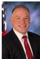
Senator Craig Wilcox (R) 32nd District

Springfield Office: 105D Capitol Building Springfield, IL 62706 (217) 782-8000 District Office: 5400 W. Elm St. Suite 103 McHenry, IL 60050 (815) 455-6330 (815) 679-6756 FAX