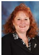
Senator Laura M. Murphy (D) 28th District

Springfield Office: 108E Capitol Building Springfield, IL 62706 (217) 782-3875 District Office: 880 Lee Street Suite 100 Des Plaines, IL 60016 (847) 718-1110