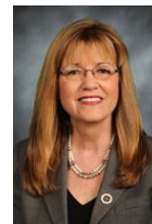
Senator Melinda Bush (D) 31st District

Springfield Office: 121C Capitol Building Springfield, IL 62706 (217) 782-7353 District Office: 10 North Lake Street Suite 112 Grayslake, IL 60030 (847) 548-5631 Assistant: Katie Holmes