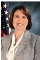
Senator Sally J Turner (R) 44th District

Springfield Office: M103A Capitol Building Springfield, IL 62706 (217) 782-6216 District Office: 120 S. McLean St Suite A Lincoln, IL 62656 (217) 651-8291