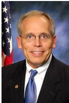
Senator Dave Syverson (R) 35th District

Springfield Office: 105E Capitol Building Springfield, IL 62706 (217) 782-5413 District Office: State of Illinois Building 200 S. Wyman, Suite 302 Rockford, IL 61101 (815) 987-7555 (815) 987-7563 FAX