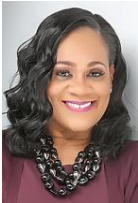
Senator Kimberly A. Lightford (D) 4th District

Springfield Office: 329A Capitol Building Springfield, IL 62706 (217) 782-8505 District Office: 4415 Harrison St. Suite 550 Hillside, IL 60162 (708) 632-4500 (708) 632-4515 (FAX)