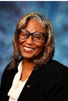
Senator Doris Turner (D) 48th District

Springfield Office: 108D Capitol Building Springfield, IL 62706 (217) 782-0228 District Office: