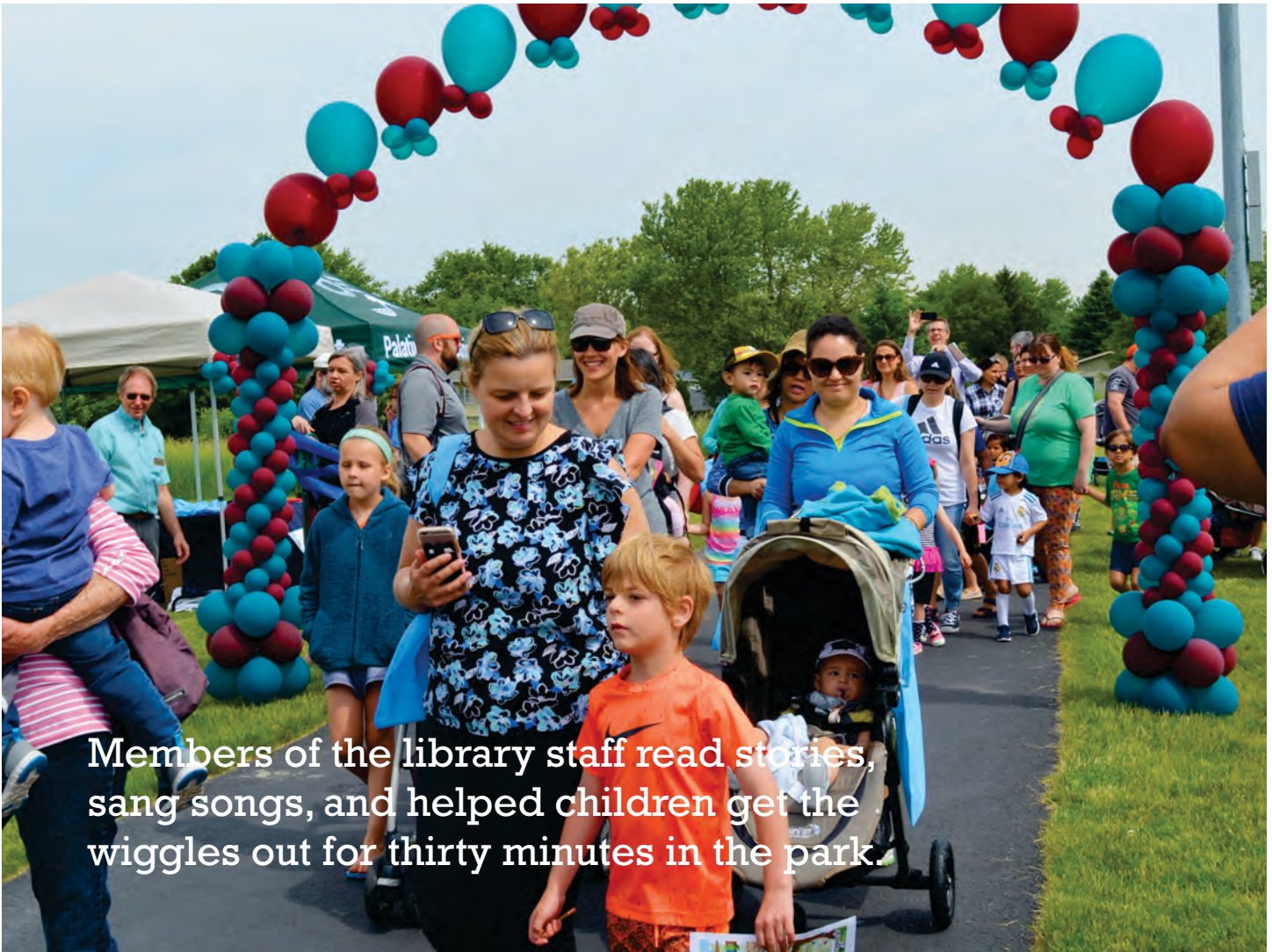
Members of the library staff read stories, sang songs, and helped children get the wiggles out for thirty minutes in the park.

The majority of the 94 acres at Hamilton Reservoir is leased by the park district from the Metropolitan Water Reclamation District and is home to five baseball/softball fields, a natural turf area that can fit up to nine soccer fields, a concession building with public restrooms, a playground renovated in 2014 with a poured in place accessible surface, over 275 parking spaces, and a .9 mile paved path around the entire park. With athletic events taking place almost every day from April through October, traffic at the park is heavy which would allow for expanded access to the StoryWalk.