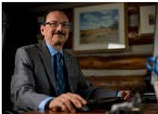
© 2017 CMC-Today & Dwight W. Mihalicz, CMC