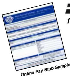
Online Pay Stub Sample

With a tradition of service in Indiana since 1899, Boyce and Komputrol continue to provide products to enhance productivity, save time, save money and reduce paper waste. K-Time , our Time and Attendance Software promotes accuracy and efficiency by eliminating duplicate data input. Doculivery For Payroll , our online Pay Stub and W2 service enhances your Green Initiative by reducing unnecessary printing! For more information contact sales@boycesystems.com .