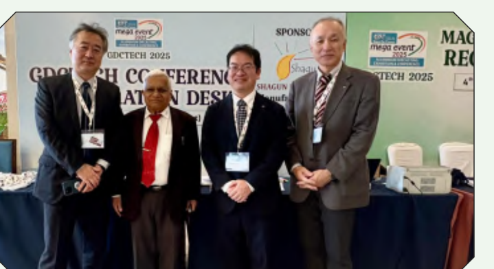
Meeting with Japanese Association