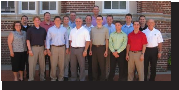
Inaugural Emerging Leaders Class