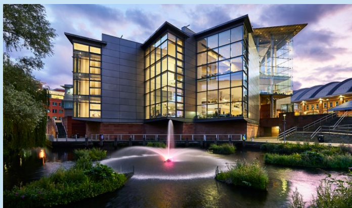
THE BRIDGEWATER HALL