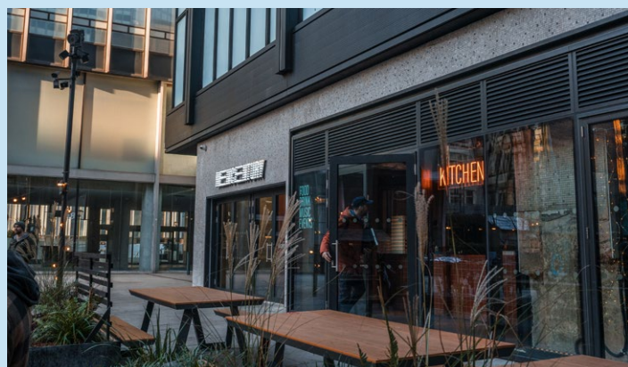
NEW CENTURY HALL