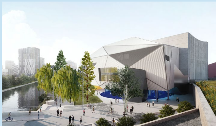
OMA / FACTORY INTERNATIONAL