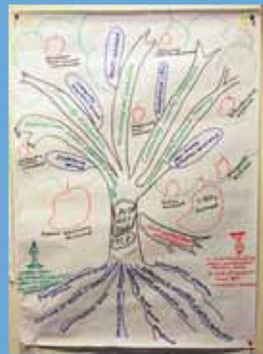
Thushan Kapurusinghe’s ‘results tree’ portrays many complex ideas at a glance. (UNV)

Effectively, the ‘tree’ distils a four-page report into one simple and easy-to-absorb image.