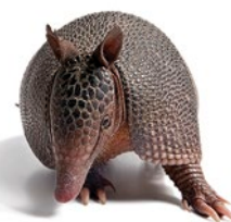
EXHIBIT TABLE SPONSOR: $2,000 (Member Exhibitors) $2,500 (Non-Member Exhibitors)