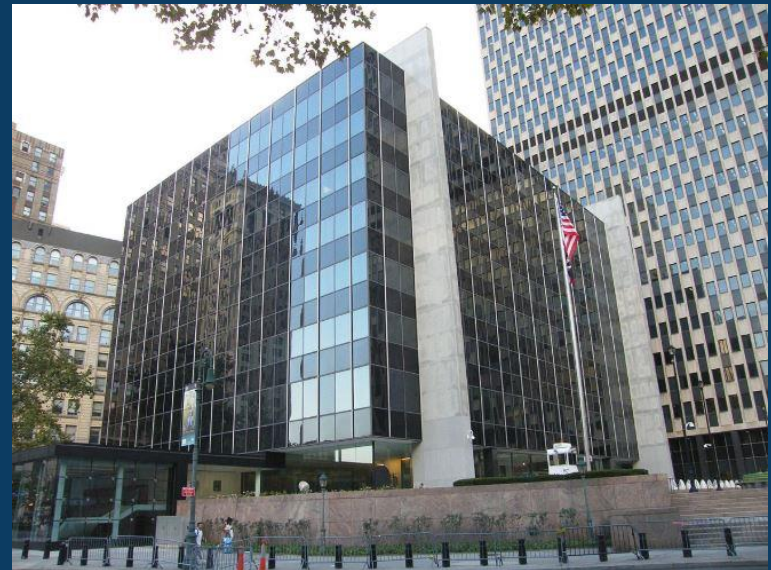
U.S. Court of International Trade