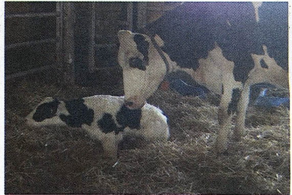
This calf has a short time with her mother before she is ripped away and forced into a life of imprisonment for milk production.

Together, we can build a better world where animals are no longer forced to endure mistreatment and exploitation. Please help us realize our dream of a kinder food system by helping Mercy For Animals raise $1.5 million to fuel our 2020 work.