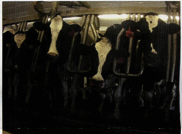
Mother cows are forced into a cruel cycle of milk production where they are impregnated over and over again so they are almost constantly producing milk.

Soon after being born, Bessie was heartlessly ripped away from her mother and stuffed into a tiny “calf hutch” barely larger than her body. She was imprisoned there until she was old enough to be forced into the cruel cycle of milk production. She was impregnated over and over again, pumped full of artificial hormones to produce up to 10 times as much milk as she would naturally. Like her mother, she had baby after baby torn away from her. When her body became worn out from this abuse, she was deemed worthless to the industry and sold for slaughter.