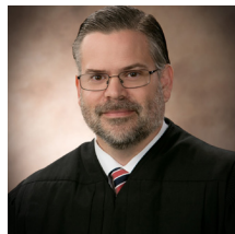
Justice Caleb Stegall Topeka