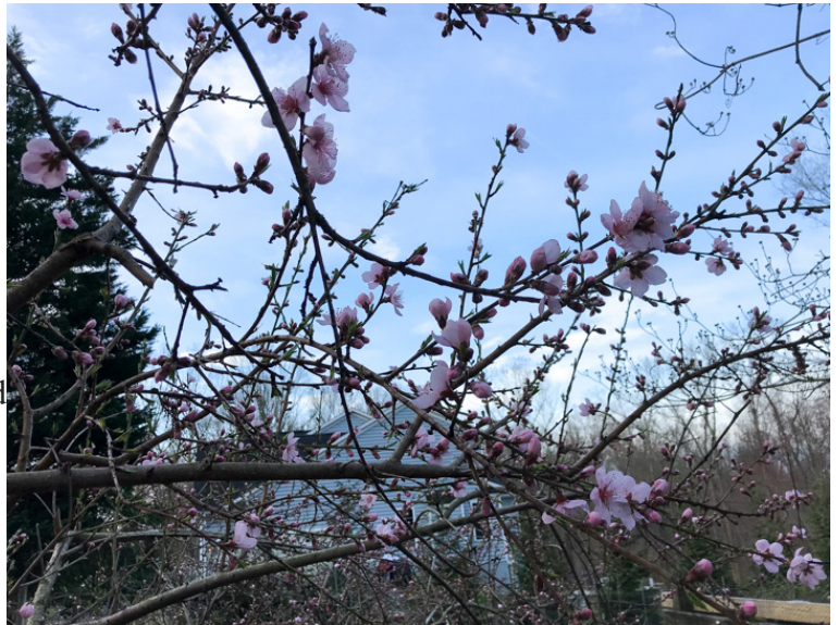
Peach trees are in flower in many areas this week and will be impacted by the cold temperatures

have come into bloom in the last week. This cold will kill many of the ovals and the fruit will likely abort in about the next 2 weeks. Many apricots are in full bloom and the extent of damage will be very high tree this year. You will want to mention this damage to your customers because they will ask you later this spring what happened to the fruit on many of their fruit plantings. Note oriental plums come into bloom first, followed by European plum types. The European types may be far enough behind in bloom that they will make it through. If you are growing the native beach plum, it is one of the last plums to bloom and will not be impacted by this April 1st and 2 nd cold period.