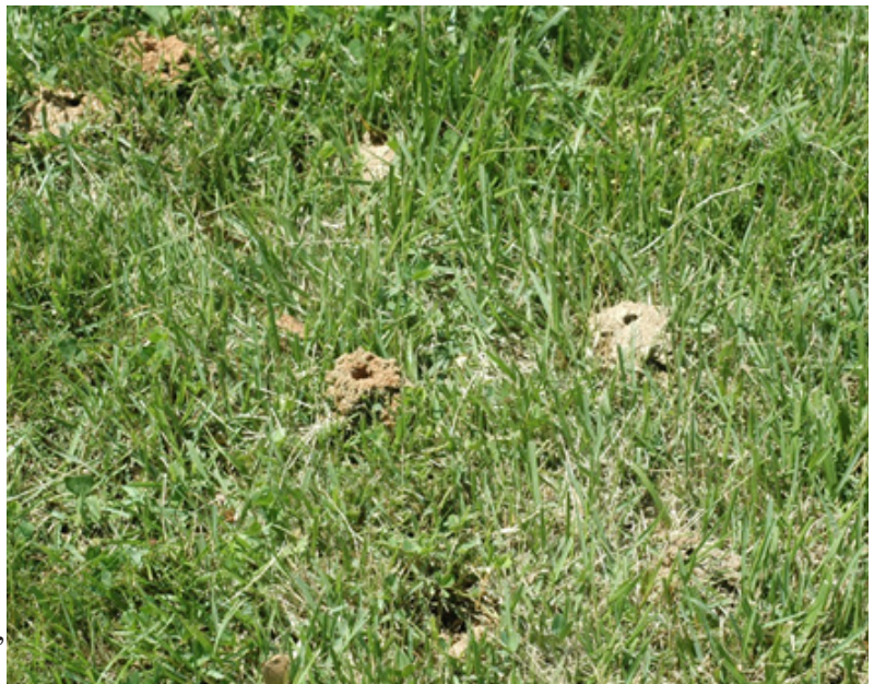
Above are the tumuli (opening with soil mounded around it) of nesting burrows of plasterer bees in a home lawn. Aggregations of these solitary bees are common in lawn areas with sandy soil and/or thin turf.