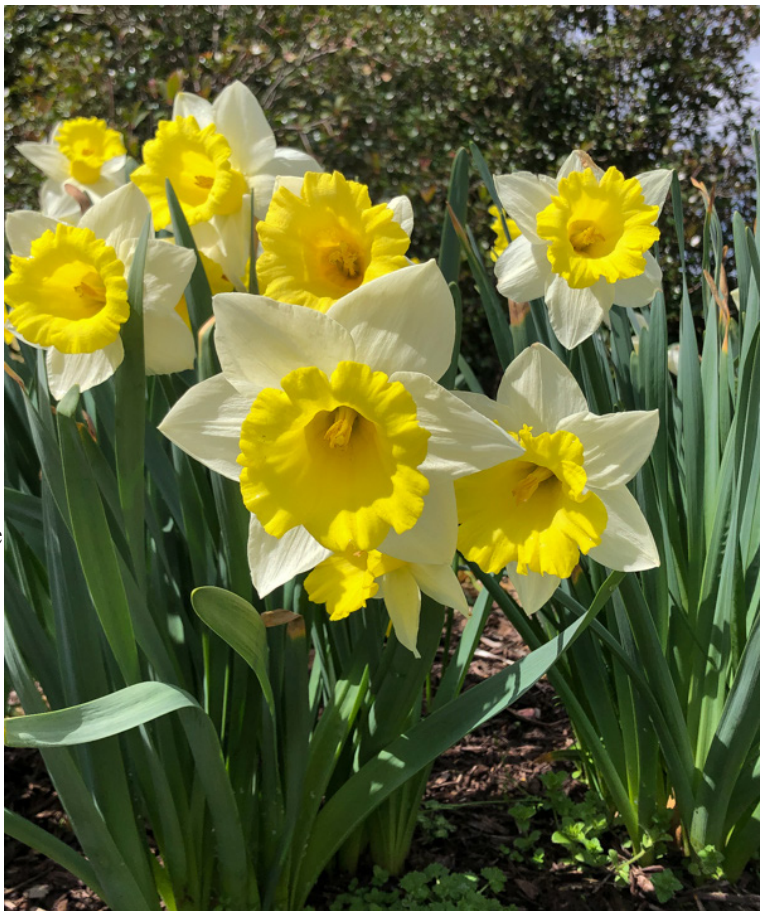
Daffodil 'Las Vegas' should be dug and separated once every 8-10 years