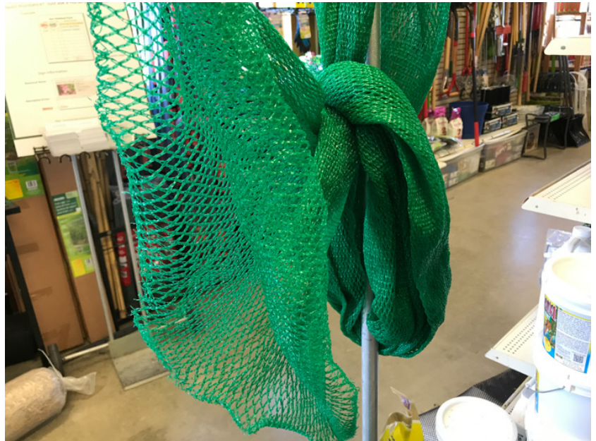
One of the netting options to prevent female periodical cicadas from laying eggs on small trees

Use a netting with ¼" or slightly smaller diameter holes. The netting we are using in these photos was from Industrial Netting Distributors. This link https://www.industrialnetting.com/cicada-netting.html will take you directly to their website to see sizes and prices. Make sure the netting drapes to the ground and you might want to put some weight on it so the wind does not blow it off.