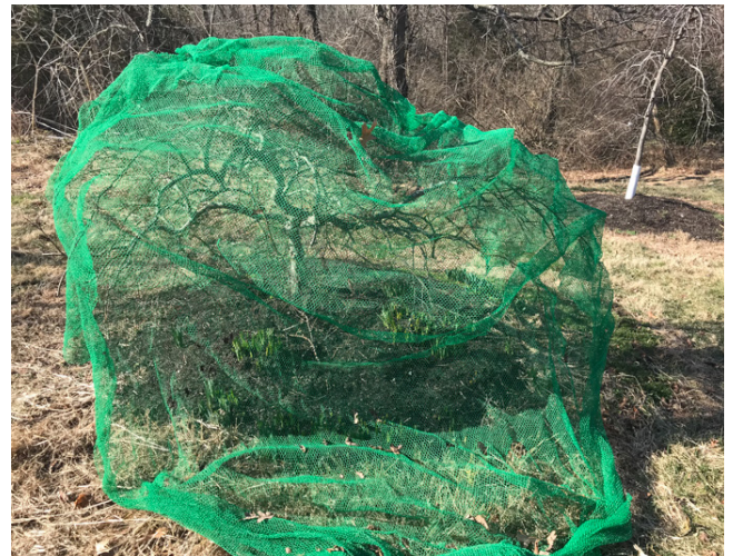
A demonstration of a small red maple before netting and the tree protected with the netting over it. It is good to weight the netting down at the base to keep the wind from blowing it off. Wait for egg-laying before netting trees.