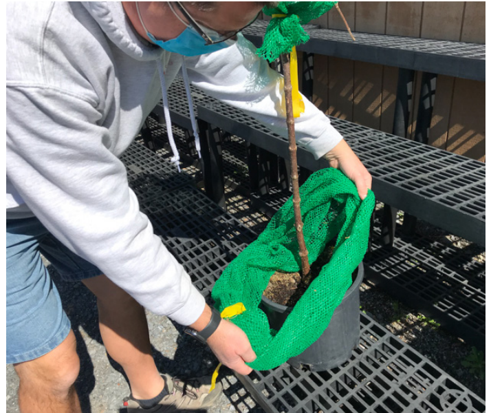
The netting will also cover the trunk of this small caliper tree to prevent the females from laying eggs