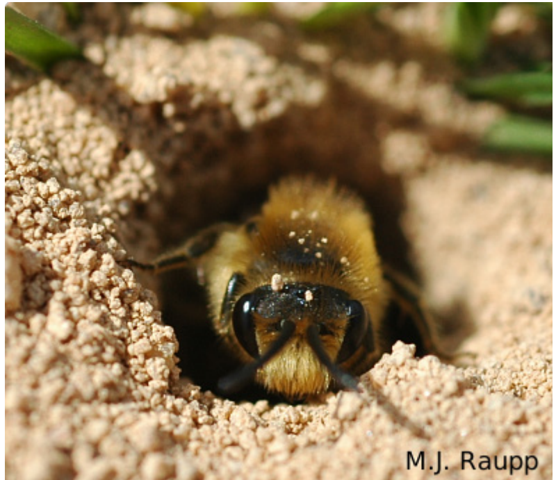
Plasterer bee emerging from the ground nest she has dug and provisioned with pollen for her brood.

When it comes to ground nesting solitary bees the answer may be in the eyes of the beholder! Today, I would like to discuss plasterer bees which are a group of solitary bees in the family Colletidae, sometimes referred to as colletid bees that nest in the ground. One of the most common species of ground nesting bees in northeastern North America is Colletes inaequalis , but there are several other common species.