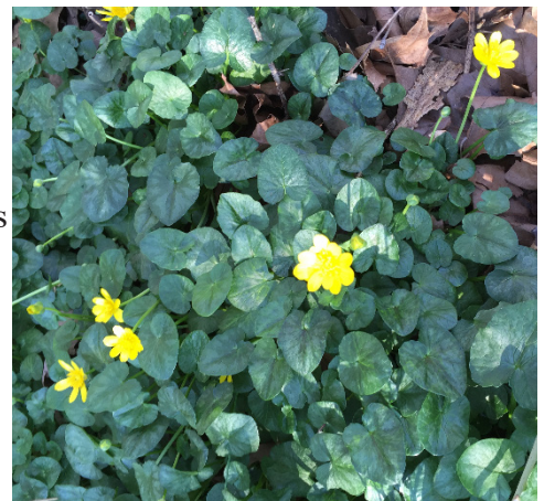
Close-up of lesser celandine flowers