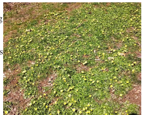
Lesser celandine can quickly take over an area