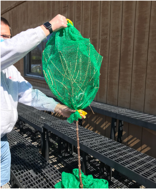
The tube netting is pulled over the canopy of the tree