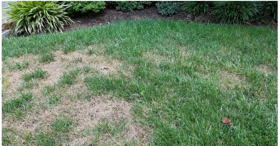
Feeding by chinch bugs causes yellowing or dead areas in turf