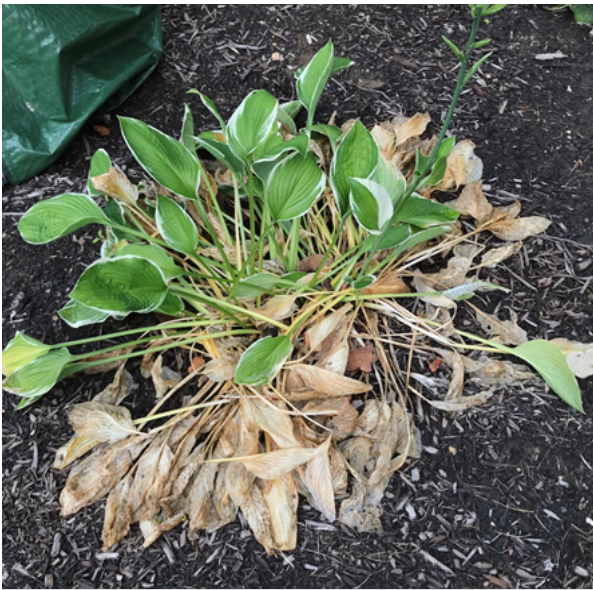
Figure 1. Hosta collapsed from southern blight

Strict sanitation is critical for disease management. Check new plants for symptoms or sclerotia to avoid introducing the pathogen. Carefully remove diseased plants and the soil and mulch around the plants, and discard – do not compost this material. Clean tools to avoid moving the pathogen in contaminated soil. Fungicides available to commercial applicators such as azoxystrobin, PCNB or thiophanate methyl may help reduce disease spread.