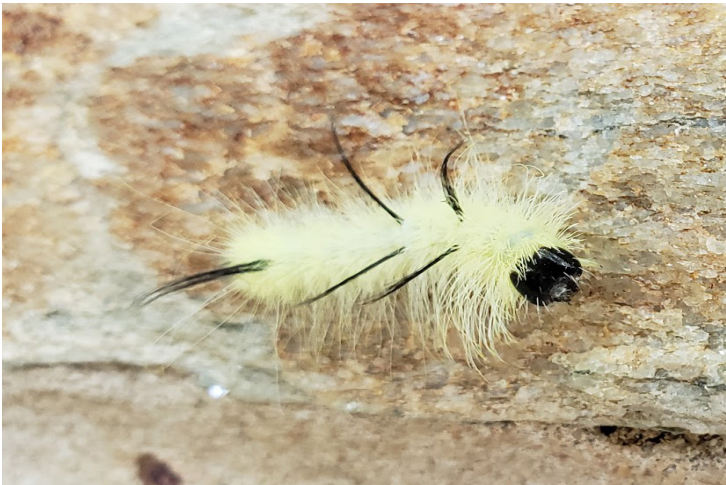
Tussock moth caterpillar