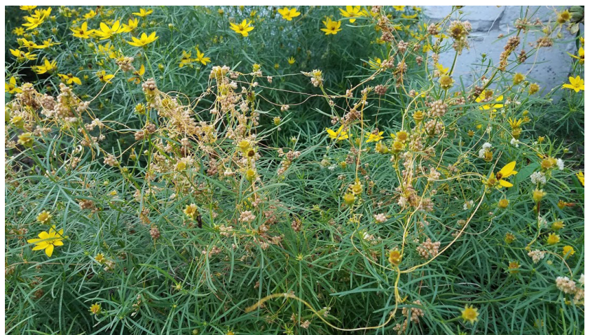
Dodder can be very difficult to remove from a site

See more information in Chuck's Weed of the Week today.