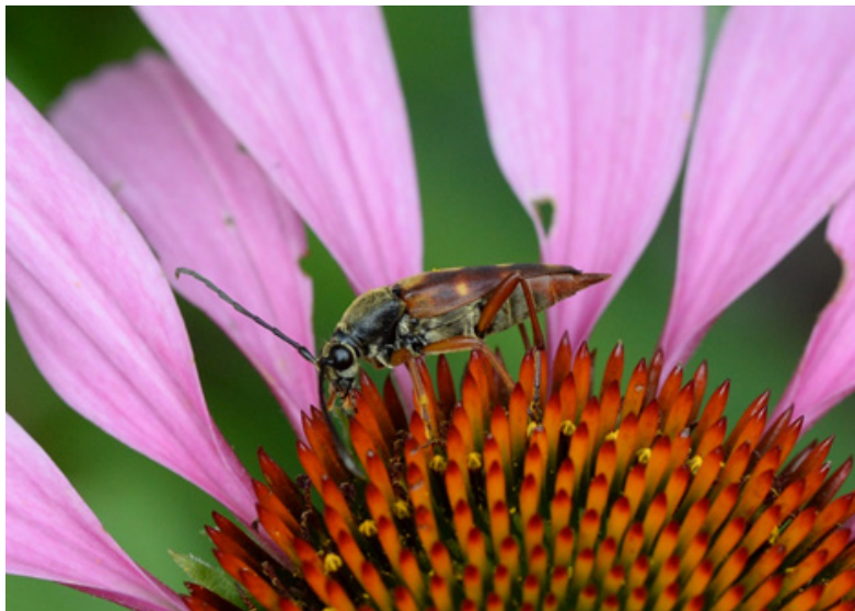
Note the dusting of yellow pollen on the back, legs, and mouthparts of this pretty flower longhorn beetle on cone-flower

When we hear the name longhorn beetle, many of us think of pest insects such as the Asian longhorn beetle, twig girdlers, or others. But there is more to this story. The earliest pollinators of plants were likely beetles. Unlike butterflies or bees whose mouthparts are adapted to sipping nectar from blossoms, beetles have chewing jaws designed for biting and munching food. Early on in the pollination game, beetles learned that pollen was a rich source of protein and for more than a hundred million years, beetles have been pollinating flowering plants. Recently and over the years, we have seen a number of long horned beetles in the subfamily Lepturinae, commonly known as flower longhorn beetles, on flowers feeding on pollen.