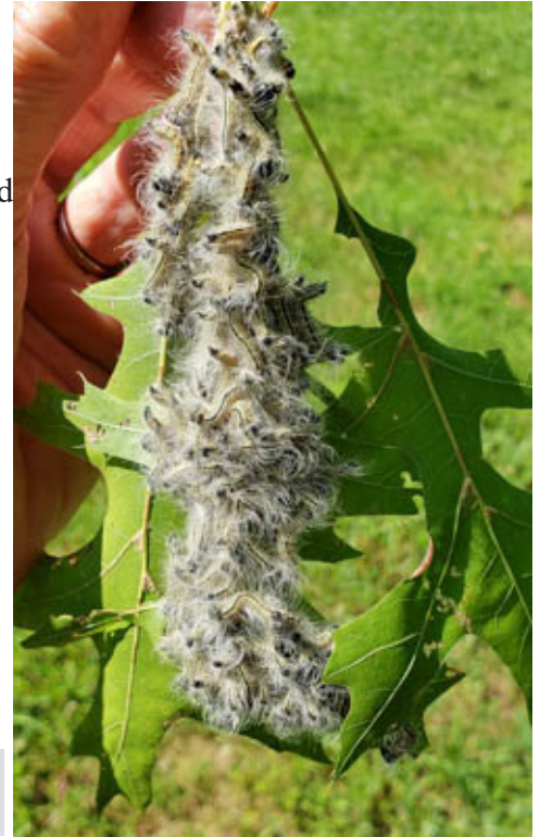
Yellownecked caterpillars are devouring these oak leaves

Several people are reporting mass feeding of yellownecked caterpillars this week. Datana ministra , the yellownecked caterpillar, is a moth of the family Notodontidae and is very active in late July to early August. They are general feeders and can be found on oaks, honeylocusts, walnuts, chestnuts, fruit trees, crabapples, and many other species of trees. The head is jet black; the segment behind the head is bright yellow, hence its name. Larvae are black with four yellow stripes on each side. Since they feed in clusters, they are easy enough to physically remove. If you need to treat, try using Spinosad to have the least impact on beneficial organisms.