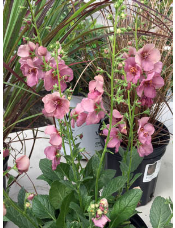
Verbascum 'Plum Smokey' is a biennial that self seeds

Verbascum 'Plum Smokey' is a hybrid and many of the seedlings may not be true to type. Plants are drought tolerant and do not thrive in heavy wet soils, but are very tolerant of urban conditions, rabbits, and deer. The flowers can be used for cutting and will bloom from early to mid-summer attracting both butterflies and hummingbirds that brighten up the gardens. Verbascum 'Plum Smokey' can be planted for a mass planting, a border, cottage garden, or a naturalized area. Occasional pests include spider mites in hot weather, and wet soils will kill the plants.