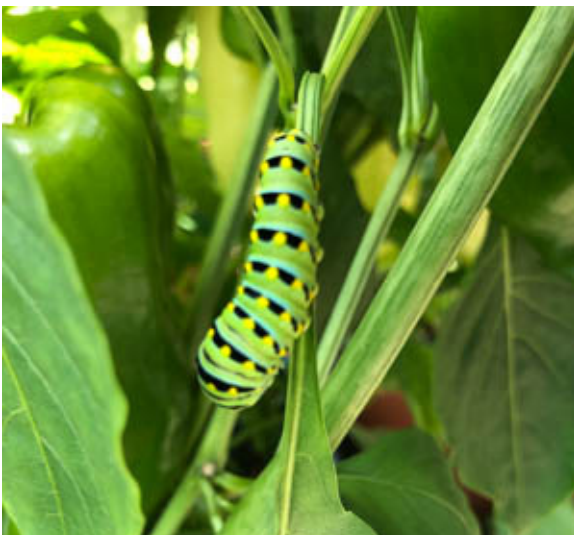
Black swallowtail caterpillar