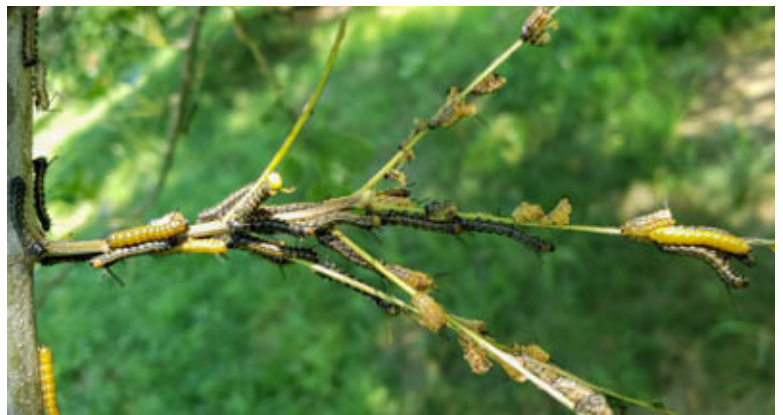
Orangestriped oakworm caterpillars