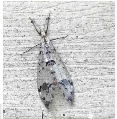
Adult spotted winged antlions visit lights at night

Nancy Woods found this spotted winged antlion, Dendroleon obsoletus , at her house on July 23. Antlion nymphs are predators that create funnel-shaped pits to catch ants crawling along the ground. They are most common in areas where soil remains on the dry side. Depending on the species, adults eat pollen and nectar or feed on other insects.