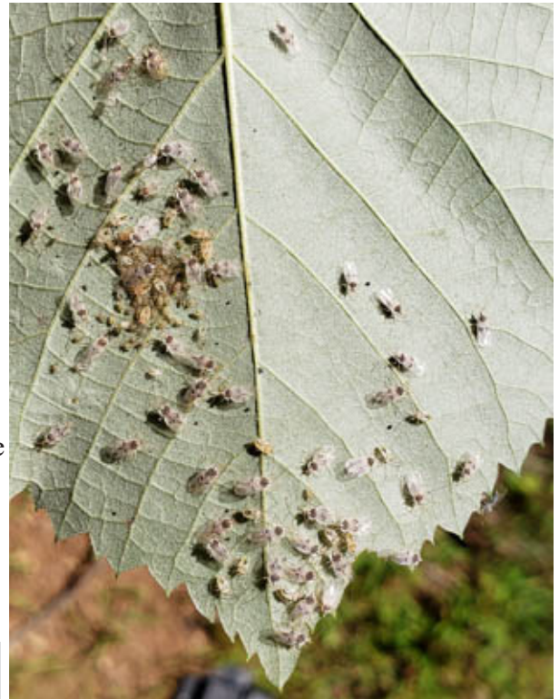
Various stages of lace bugs are infesting this silver linden leaf

Control: Monitor plants regularly for signs of lace bugs. Generally, infestations on deciduous trees do not require treatment. However, if damage is heavy and lace bugs are actively feeding, treatment may be necessary. Get good coverage of horticultural oil on the underside of foliage to reduce populations. Systemic insecticides will give control. Many products are labeled for lace bugs. See more on lace bugs at: http://extension.umd.edu/learn/lace-bug-hg95#sthash.fl07cYzP.dpuf .