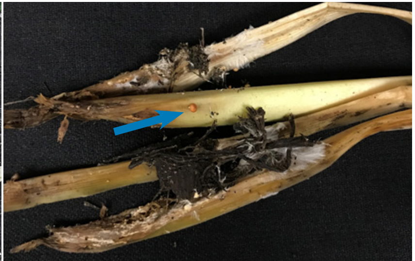
Figure 2. White mycelium and sclerotium (arrow) of southern blight fungus at base of rotted hosta petioles.