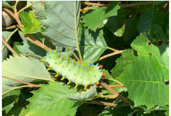
Cecropia moth caterpillar