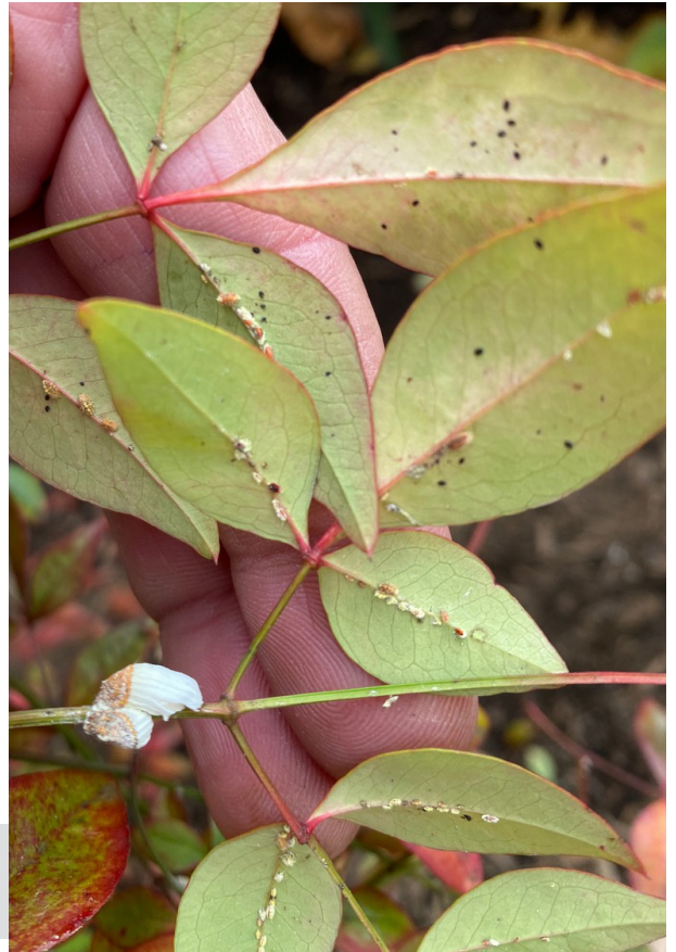
Cottony cushion scale was still active on nandina in Herndon, VA in late November

It is cottony cushion scale Icerya purchasi on Nandina 'Obsession'. This one is a first for me this late in the season. The warm November must have given it enough warmth for some of the females to produce a white egg mass, which is very unusual for this late in the season. The cold front that blew in should cease the egg laying and any crawler activity in December.