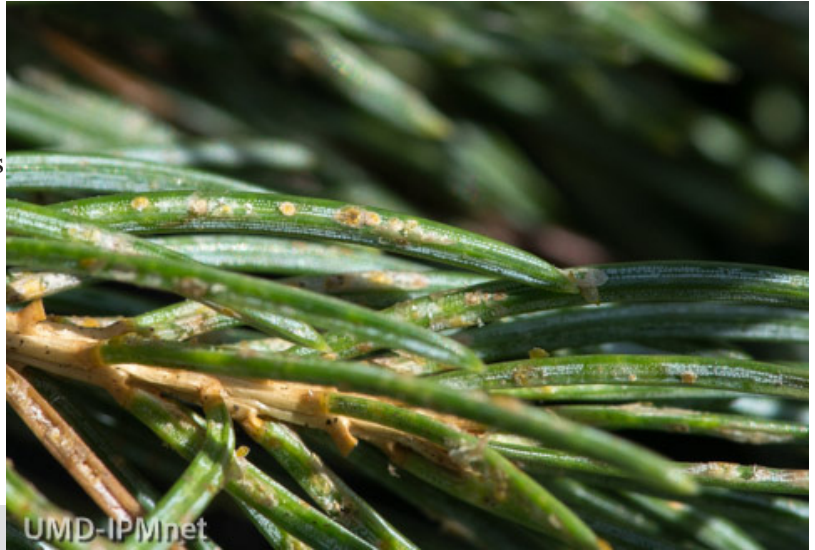
Cryptomeria on blue spruce (late Sept. 2013)

Karen Rane received a sample into the Plant Diagnostic Lab in early December. She forwarded the branches to me since it was a scale insect. The scale was second instar stages of cryptomeria scale. Cryptomeria scale overwinters as 2 nd instars which mature in spring. Crawlers are active about the time conifers put out their new growth (called the candle stage). We have had several Christmas tree operations with this scale. Be sure to check to check the foliage closely.