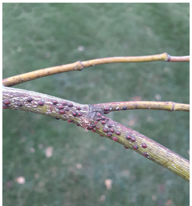
A lecanium scale coating the stem of a magnolia

Rob Barrett sent in these recent photos from trees in New York State that were infested with what is likely terrapin