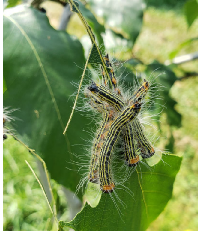
Yellownecked caterpillars are active through the end of summer