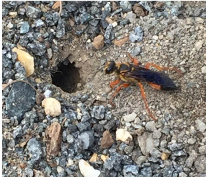
Great golden digger wasps provision their nests with paralyzed katydids and crickets