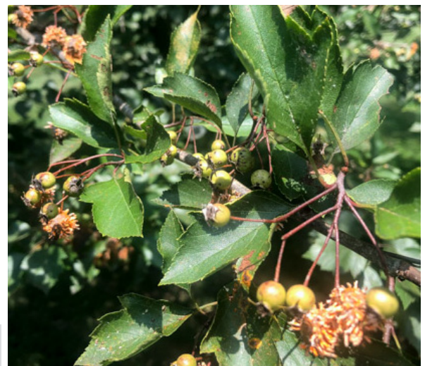
Cedar apple rust on hawthorn fruit

We have visited a couple of sites with fire blight showing up on European and Asian pears in Potomac, Rockville, and Davidsonville in the last month. Pruning this damage out well below the infected tissue on dry days is the best you can do for this bacterial disease in summer.