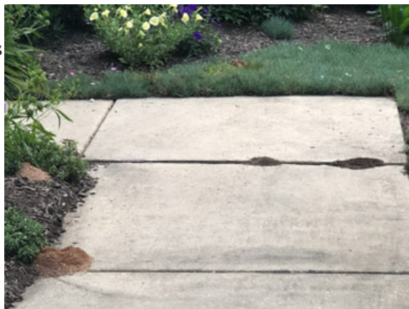
Cicada killer mounds on a sidewalk

Dog day cicadas ( Tibicen canicularis ) are active at this time of year. You can hear the adult cicadas at night. Look for the predaceous female cicada killer wasp that takes the paralyzed cicada back to a burrow to feed its young. No control is necessary.