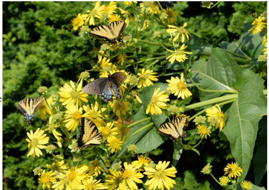
2019 was a great year for butterflies as you can see from the amount of activity on this cup plant, Silphium perfoliatum . I counted 35 butterflies on the plant at one time!

prey (Lepidoptera) abundance starts to go up again. Cycles of natural enemies and their prey items is a common phenomenon in nature and occur over years. Insect population cycles usually occur every 5 - 10 years.