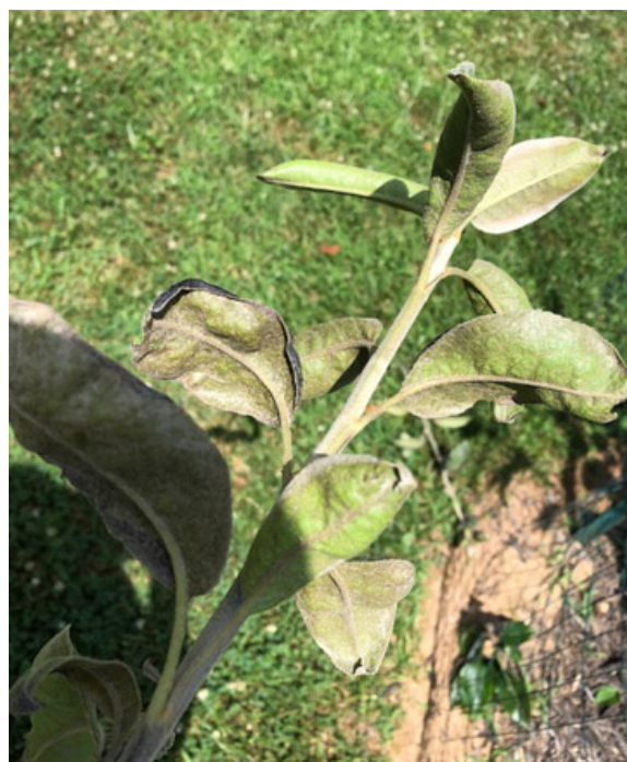
Powdery mildew on apple foliage