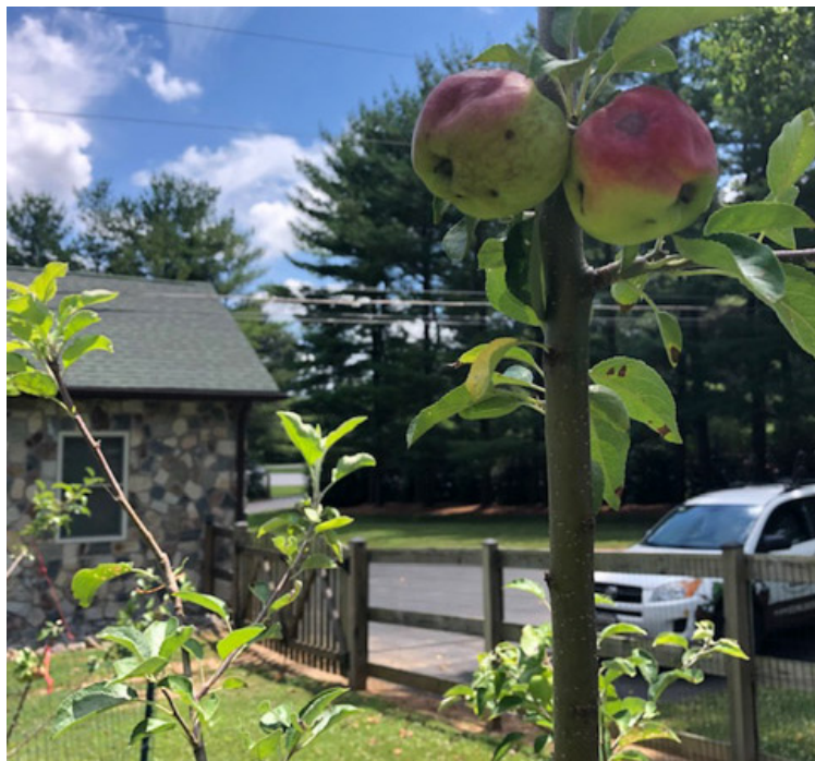
Plum curculio damage on apples

Josh Rosenstein, Edible Eden, sent in pictures of an organic apple planting he had worked on, asking what was damaging the foliage and fruit. A little of everything, disease-wise, showed up after a very cool and wet spring with high disease inoculum putting pressure on even disease resistant apple varieties. Apple scab and powdery mildew are showing up on his plants. Insect damage includes leafhopper damage and plum curculio damage. It is too late in the season to correct these problems. Well timed, preventative applications back in April through June would have really made a difference in a season like 2020. If your customers are seeing poor quality fruit this summer, they are not alone.