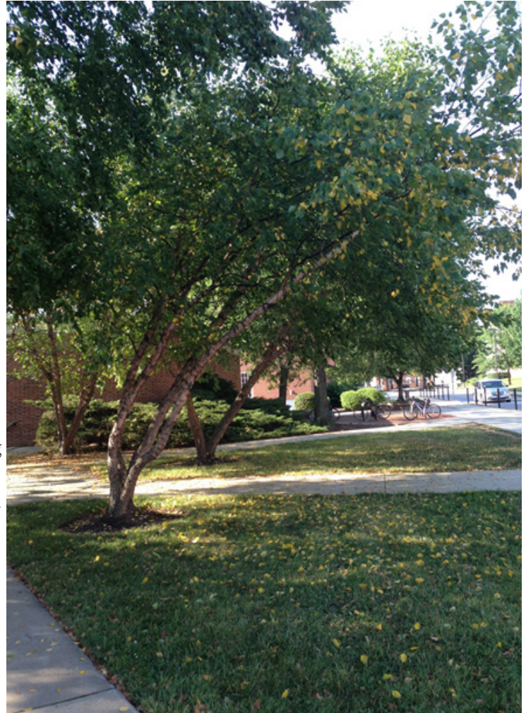
Yellowing foliage and leaf drop on river birch, a common occurrence during periods of high temperatures.

We aren't the only ones feeling the heat lately. High temperatures can have a significant impact on the health and vigor of a variety of plants. In particular, leaf drop in trees, such as tulip poplar and river birch, is a symptom we are likely to observe throughout this stretch of hot weather. Leaves may also appear wilted, scorched (browning around the leaf margins), or yellowed. Symptoms are favored by limited moisture available to the plant. During high temperatures, moisture evaporates from the leaves rapidly and roots cannot replace the moisture as quickly. Thunderstorms that accompany hot summer weather may provide enough soil moisture for trees in some locations, but storms are usually scattered and some areas do not receive adequate rainfall. We may not be able to control the high temperatures, but reducing overall stress of the tree with proper irrigation (deeply soaking the root zone once every 7-10 days if conditions are dry) can help mitigate the overall impact of heat stress.