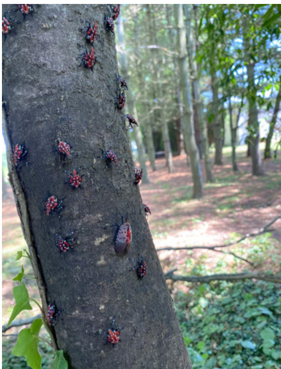
Nymphs and adults are active in Cecil County