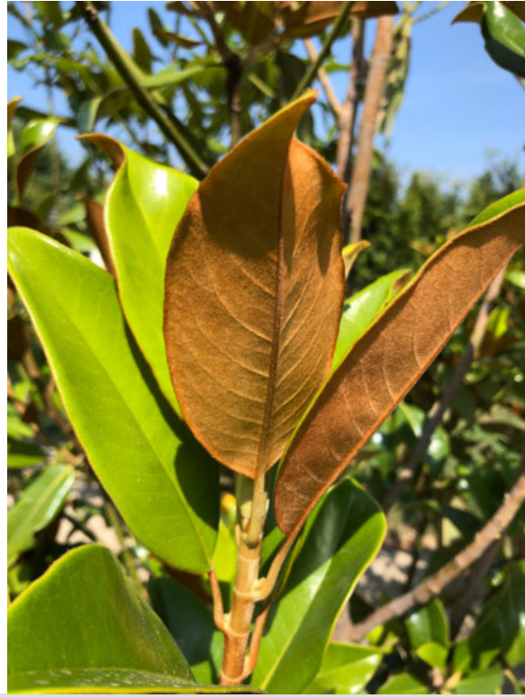
Magnolia grandiflora 'Bracken's Brown Beauty' is a smaller cultivar growing to 20-30 feet tall

Correction Note: Last week's report included the crape myrtle cultivar 'Potomac', but it should have been 'Pocomoke' for that particular cultivar series. There is a cultivar called 'Potomac'.