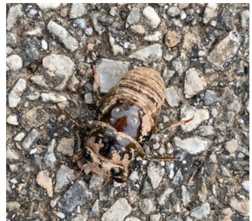
This dog day cicada nymph was found crawling across an asphalt sidewalk on July 20