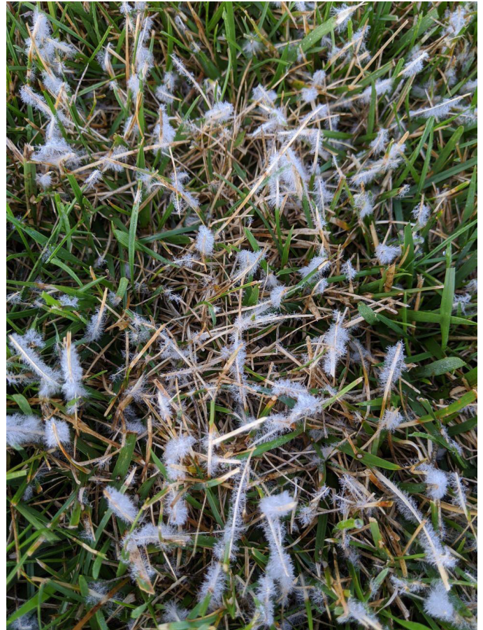
This heavy dollar spot infection was found in Cockeysville this week