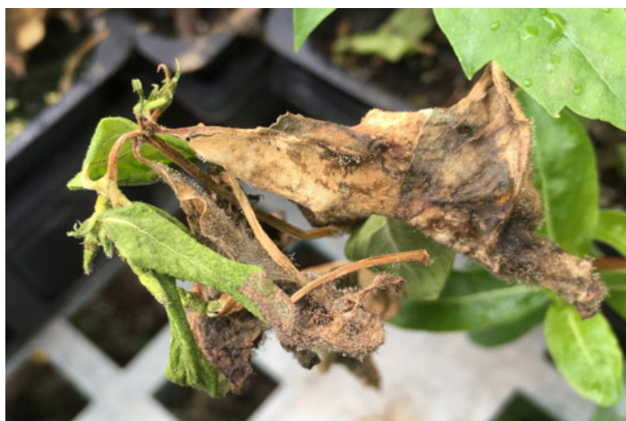
Botrytis on a petunia flower (left) and a vinca plant (right)