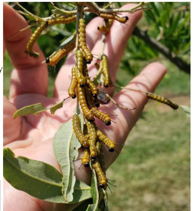
Orangestriped oakworms will continue to be active through the summer

Marie Rojas, IPM Scout, found orangestriped oakworms on Quercus phellos and Q. coccinea this week. These caterpillars feed in clusters and initially skeletonize leaves. Larger caterpillars are defoliators and only leave behind the leaf mid-rib. The caterpillars will feed en masse and completely defoliate whole branches. Control is best when caterpillars are in the early instar stages. Bt and Spinosad work very well. Acelepryn or Mainspring will also work well.