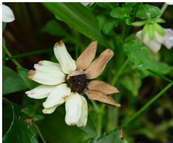
Botrytis on a zinnia flower

With recent evening rains in our area, Gray mold caused by the fungus Botrytis cinerea , may become more visible on old flowers and yellowing foliage of annuals and herbaceous perennials. In some cases infected tissue can become fuzzy gray overnight, or may become spotted. In severe cases infection of petiole stubs can lead to stem cankers. Prolonged humidity and our high summer temperatures can create a perfect storm for infection. Sanitation in the form of grooming older leaves and dead heading old flowers from plants is the most important step in managing Botrytis infection. When possible avoid irrigation late in the day to allow foliage to dry before nightfall. Thin or space plantings to promote better air circulation. Unfortunately fungicides cannot control heavy infections, and in addition, Botrytis has developed resistance to several fungicide groups. The best management strategy is to keep up with your maintenance schedules and to remove any older flowers and foliage before infection.