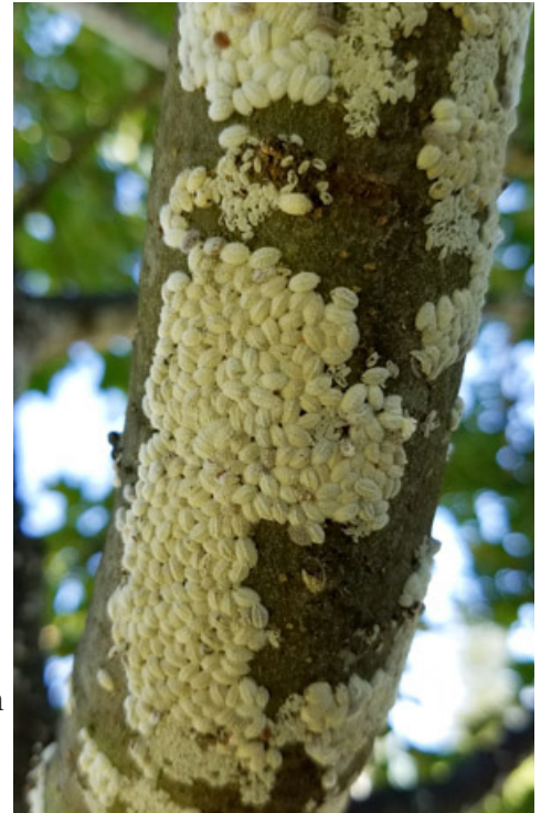
Oak eriococcid scale is heavily coating this bur oak trunk

At this time of year, watch for crawlers over the next 2 – 3 weeks and use either Distance or Talus insect growth regulator.