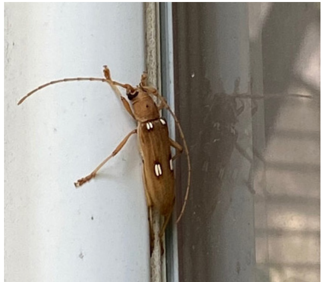
Ivory-marked longhorned beetles infest dead hardwood trees