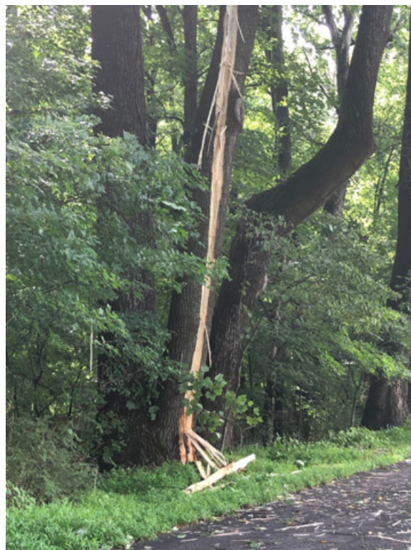
Tree damaged by a lightning strike in Monkton on July 22