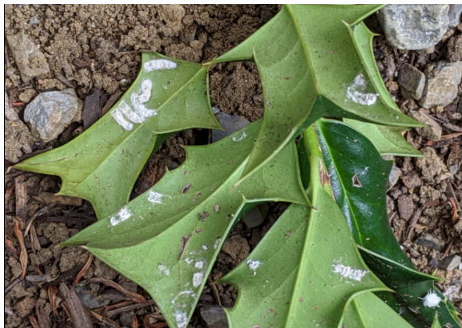
Settled 1st instars of cottony Taxus/camellia scale are present on host plants such as holly now

What David is seeing is the settled 1 st instar stage of the cottony Taxus/Camellia scale on the undersides of the foliage. A systemic insecticide would control them in July, but pick a day with cooler temperatures below 90 °F.