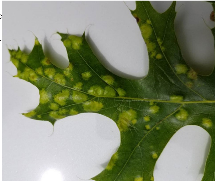
Oak leaf blister symptoms

We received photos of an odd leaf symptom on oak from Ron Rubin at Savatree. Yellow, raised spots were scattered over the leaf surface. This is oak leaf blister, a disease caused by the fungus Taphrina caerulescens . Infection occurs in early spring as buds open, and light green, blisterlike areas develop on leaves as they expand. The yellow “blisters” develop a whitish spore layer on the underside, and spores are spread to bark and bud scales by rainfall, where they remain until next spring. As the growing season progresses, the blistered areas become dark brown. Control is usually not warranted for landscape oaks with leaf blister because the impact on the health of the tree is minimal. In nurseries, an application of a protectant fungicide such as mancozeb prior to bud break (late dormancy) may help reduce leaf blister. Once symptoms are observed, fungicides are ineffective.