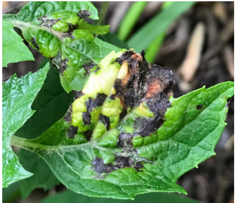
Close-up of leaf spots caused by Xanthomonas on oakleaf hydrangea