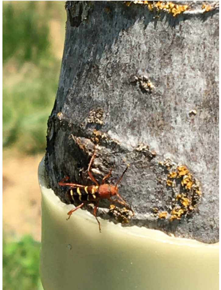
Alcohol baited wood bolts for ambrosia beetles also attracted this redheaded ash borer adult