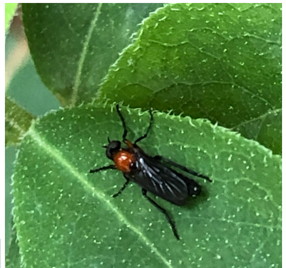
Adult mallow sawflies are laying eggs at this time

Bill Miller, The Azalea Works, sent in a great picture of an adult mallow sawfly this week. The adults are usually seen alighting on foliage in early morning hours. This sawfly is out laying eggs in the foliage of hibiscus this week. The female uses a saw-like ovipositor to cut into leaf tissue to lay eggs on the undersides of the foliage. The green colored larvae are hard to see and feed on the undersides of the foliage. Spinosad is pretty effective in controlling this pest on hibiscus.