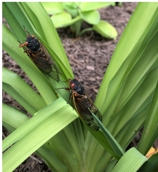
An early appearance of a few periodical cicadas