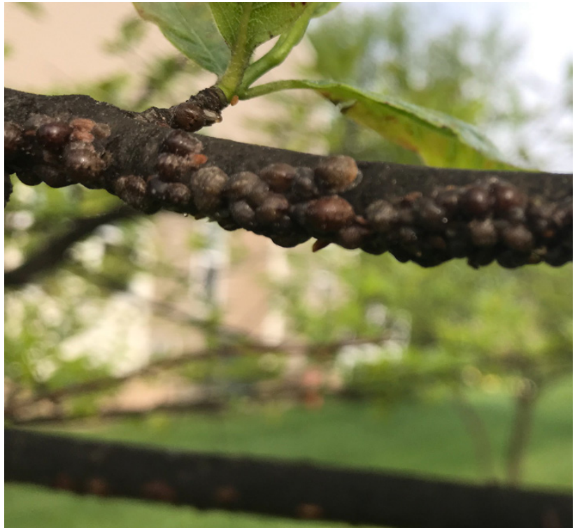
A heavy outbreak of lecanium scale on trees adjacent to properties being spraying for mosquitoes

Neighbors on both sides of me have their yards sprayed for mosquitos every year. I've tried talking to them about it but it falls on deaf ears. I have 1/4 acre and plant mostly natives, and do not spray herbicides or pesticides, garden for bird and pollinator habitat. I hope I can still maintain some level of beneficial insect populations in my yard despite their spraying but it's looking like maybe that's not the case given this scale outbreak. See attached photos of the scale."