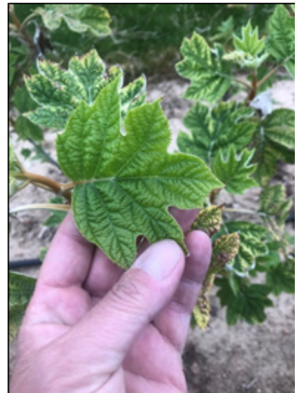
Oakleaf hydrangea with cold damage (left) and new foliage that is normal (right)