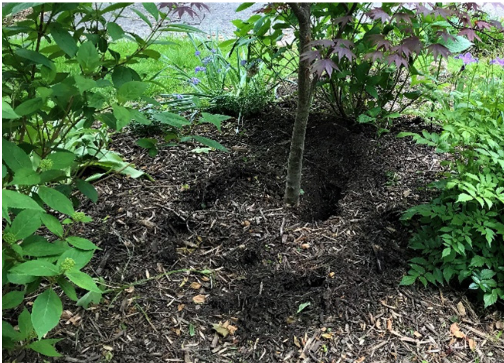
Fig. 3 Large and small holes being dug around a Japanese maple tree by an unknown digger