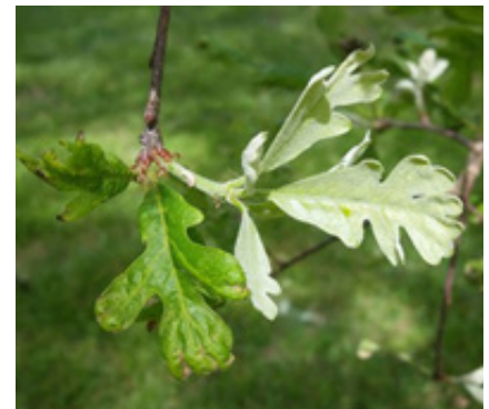
Suspected phenoxy herbicide drift damage in Quercus with regrowth

If you have questions, feel free to contact me at aristvey@umd.edu