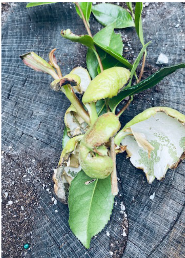
Exobasidium galls on camellia

Exobasidium leaf galls are showing up on azaleas and camellias this week. Chad Tipton, Maxalea, Inc., found the galls on azaleas in Baltimore County. Brian Scheck, Maxalea, Inc., found them in Timonium. S. Drew found the galls on camellia on the Eastern Shore. The extended cool, wet weather this spring has been favorable for the development of Exobasidium galls. On camellia, these galls are caused by the fungus Exobasidium camelliae . A related fungus, Exobasidium vacciniae , causes similar galls on azalea. Symptoms begin as puffy, light green or pinkish swollen shoot, bud or leaf tissue. Infection occurs on emerging tissue, so most infections occur in the spring when new growth is developing. The galls eventually develop a white spore-bearing surface, so removing galls before they turn white is one way to reduce infection. Older gall tissue eventually turns brown and hardens. The disease does not affect the overall health of infected camellias or azaleas, and usually does not warrant chemical management.