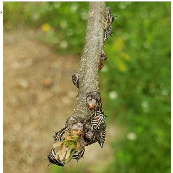
Oak treehopper nymphs are active on Quercus bicolor

Marie Rojas, IPM Scout, found oak treehoppers on Quercus bicolor in Laytonsville on May 27. They cluster on tree branches. Females guard their eggs and nymphs from predators. These treehoppers usually do warrant control treatments. There are two generations per year.