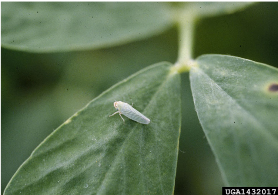
Potato leafhopper adults are arriving in the area on the jet stream at this time

Marie Rojas, IPM Scout, found potato leafhopper nymphs on the newest leaves of Acer rubrum 'Red Sunset' in Laytonsville on May 27. This pest usually arrives from the south, riding up on the jet streams. Look for leafhoppers on plants such as redbud, zelkova, river birch, maple, goldenrain tree, elm, honeylocust, sycamore, and London plane trees. Potato leafhoppers tend to be a problem on nursery trees and are not as likely to be found in high numbers on landscape trees. Potato leafhopper feeding by adults and nymphs causes the tip growth on maples to curl over and harden which is typically referred to as 'hopperburn'. The distorted growth is often mistaken as herbicide damage. Multiple generations continue to damage the new tip growth that flushes out on maples. A systemic insecticide can be used for control.