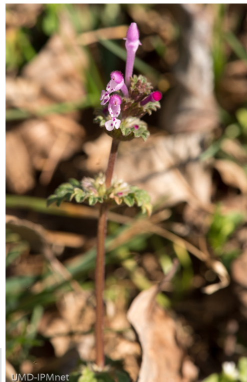
The leaves on the upper portion of a henbit stem are sessile (no petioles)

To prevent henbit from being able to complete the seeding cycle, one has several products which can be used. Look for products which include Speedzone, or a 2,4-D. The ester formulation is generally avoided as it volatilizes in warm temperatures. Fiesta will help control this plant but will take several applications. In landscape areas, consider the use of Prizefighter, Burnout, and other organic non selective products.