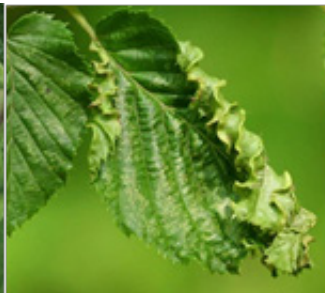
Photo B: