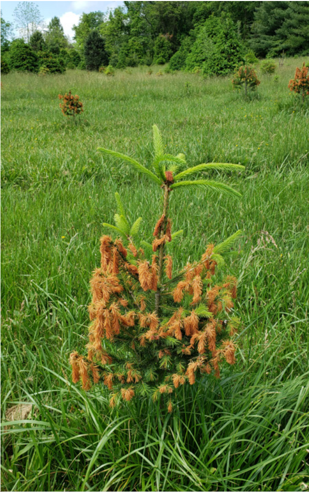
Late frost damage on Douglas firs