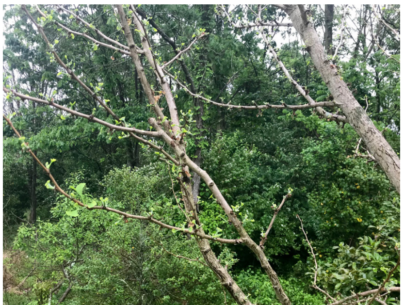
Ginkgo trees are starting to leaf out this week after the late frosts in April and May

We are getting a number of emails reporting ginkgo trees that were hit by the April 18 and May 7 and 8 frosts are really slow to recover this year. New growth is breaking this week, but it is slow to show recovery from the cold injury. Ginkgo is one of my favorite species, and I hate to see it looking so bad this spring, but it will eventually leaf out as the warming trend continues.