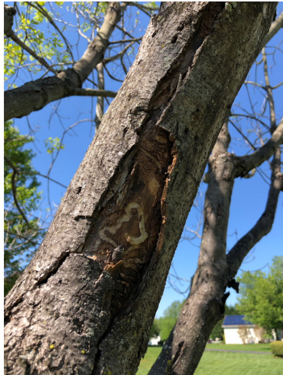
Branch dieback on this green ash is from a banded ash clearing borer infestation; note the clearwing borer mine in the trunk on the right.