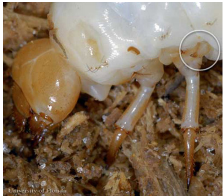
Larva of a bess beetle with close up of legs. Leg pairs 1 and 2 are normal sized, and pair 3 legs (inside white circle) are reduced in size. Legs 2 and reduced legs 3 have special structures which when rubbed together (stridulation) produce sound used for communication.

Henbit is a sparsely hairy winter annual with greenish to purplish, tender, square stems. Henbit has square stems, and a pink to purple flower. The leaves are round to heart-shaped with a rounded tooth leaf margin. The leaves on the upper part of the plant are sessile (directly attached to the stem) and lower leaves have petioles. The leaves have hairs on the upper surface and along the veins on the underside. Leaves are opposite. Henbit can develop stems up to sixteen inches in length. Flowers occur in whorls on the upper leaves and will be without petioles. Henbit has a fibrous root system and can develop roots at nodes on the square stems.