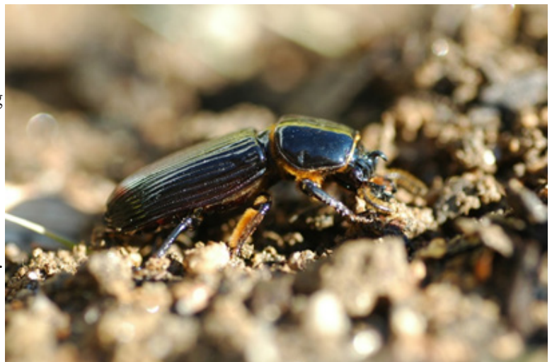
Close up of an adult bess beetle, Odontotaenius disjunctus . Note the diagnostic shape and shiny dark color of the body, deep grooves on the elytra (front wings), and the fringe of orange hairs on the second pair of legs and around the pronotum (section behind the head).