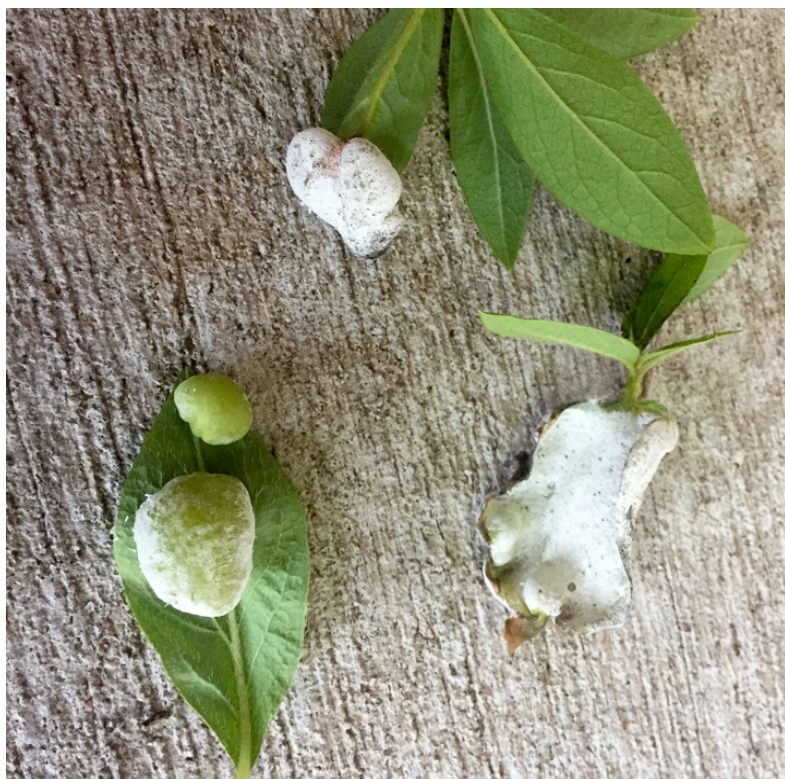
Exobasidium galls on azalea