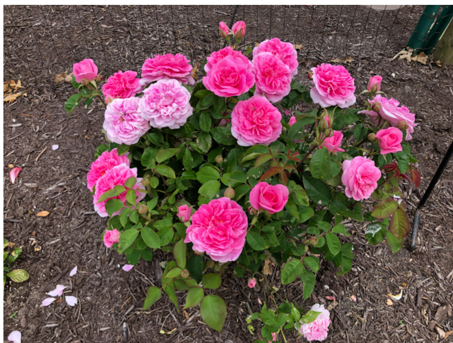
Rosa 'Ausbord' Gertrude Jekyll has an intense fragrance

Rosa 'Ausbord' Gertrude Jekyll is a David Austin shrub rose that grows 4 to 6 feet tall and wide and is cold tolerant in USDA zones 5-9. Like all roses, Gertrude Jekyll thrives in full sun locations with medium moist, slightly acidic, well drained garden loams. For best blooming, the plants like regular deep watering in the mornings. Avoid overhead watering to limit foliar diseases. A light covering of mulch helps control weeds, retain soil moisture, and keep roots cool. Gertrude Jekyll is usually grown for the beautiful flowers with an intense fragrance. The plant has clusters of large 4-inch double blooms that start as a dark pink bud then mature to a bright pink flower. As it matures, the petals soften to a light pink before scattering to the ground. This is a very fragrant