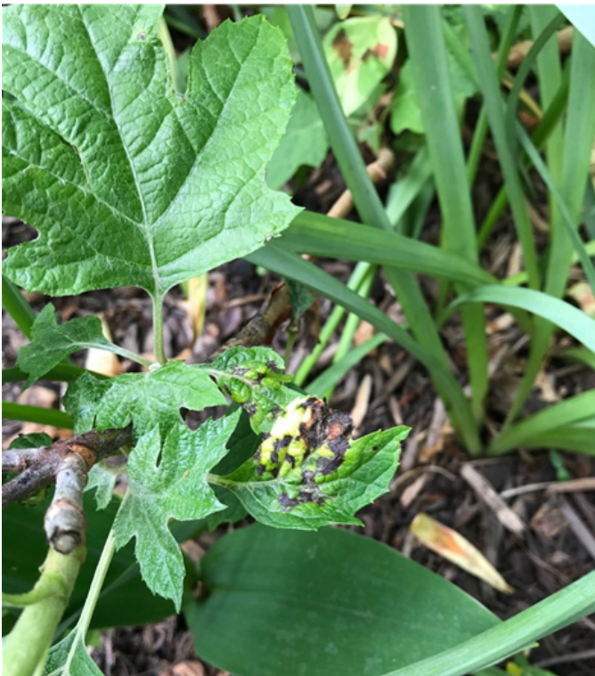
Lower leaves of oakleaf hydrangea showing symptoms of bacterial leaf spot

Examine your oakleaf hydrangeas ( Hydrangea quercifolia ) for the early symptoms of bacterial leaf spot. This disease, caused by the bacterium Xanthomonas campestris , commonly occurs during mild, wet weather in late spring and early summer. Other hydrangea species, such as H. arborescens and H. macrophylla , are also susceptible, but the disease seems to be most severe on oakleaf hydrangeas. The dark, angular leaf spots are usually first observed on the lower leaves, but the pathogen moves upward in the plant canopy through rainsplash or overhead irrigation. Later in the season, the lesions appear as purple, angular spots. In the landscape, removing lower leaves as soon as leaf spots are first observed can help slow disease spread (that's what I did with the spotted leaves in the photos!). Overhead irrigation of hydrangeas should be avoided, or timed to keep leaf wetness periods to a minimum. In nurseries, increased plant spacing can help increase air circulation and keeps the foliage as dry as possible to reduce disease.