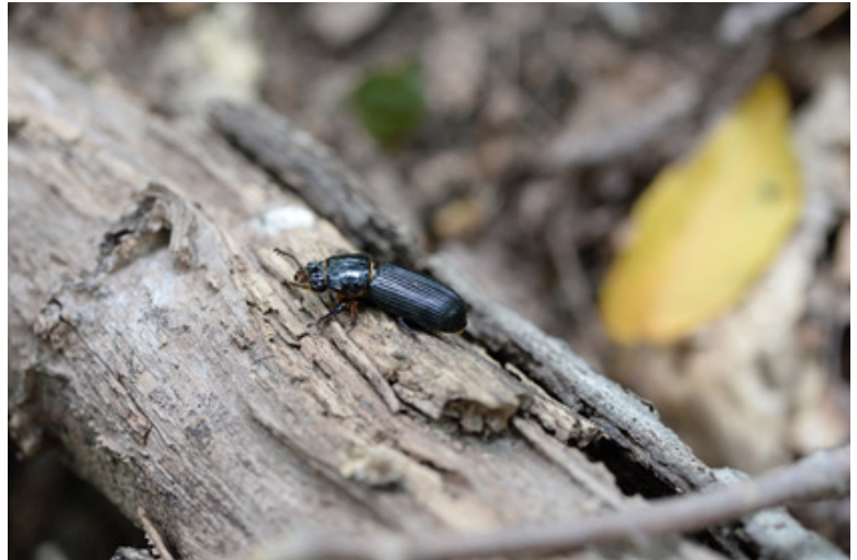
Adult bess beetle, Odontotaenius disjunctus , checking out a rotting log.

Adult bess beetles aggregate and sometimes compete for sections of a log. Clutches of eggs are laid throughout the frass –filled galleries made by the adults. These beetles have a subsocial relationship where both male and