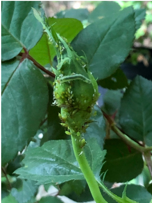
Monitor roses closely for the build-up of aphid populations

Control: Spinosad, Mainspring, Acelepyrn, and horticultural oil all work very well on this pest.