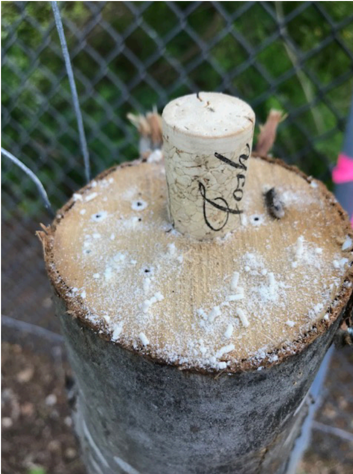
Ambrosia beetles are now going into the ends of alcohol baited wood bolts, and not just the sides