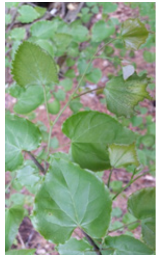
Multiple symptoms of phenoxy herbicide drift damage in Cercis

Regardless if you have frost or phenoxy injury, what can be done? In the case of frost, damaged plant tissue can be pruned out with proper pruning techniques once you determine what tissue has been affected. For herbicides, plants should be washed thoroughly, immediately after direct contact if possible. If soil was drenched, irrigation water is needed to dilute and leach herbicide. Activated charcoal is an extreme option, but I have read an effective quantity is approximately 150 times the weight of the product applied. For drift, which seems to be the most common cause, have patience again. It will take some time for the growth-regulator effects to wear off. I have observed Cercis with irregular growth two months after the beginning of symptoms. Damaged oak will sometimes grow another set of leaves. This is unusual for oaks because typically they only have one spring flush to hold them over the summer. The additional flush may be stressful. Should you fertilize in this case? Many different opinions exist. Increasing the vigor of plant growth during the affected period may not decrease the time the plants are affected. Therefore, fertilization may only add more growth with the same symptoms. In my opinion, a fall nitrogen application fertilization, could be considered, but not during the affected time period.