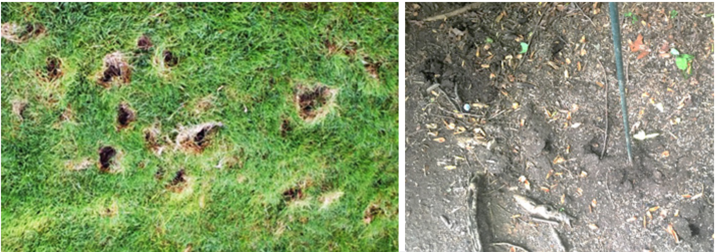
Figs. 1 and 2 Damage to lawn and landscape areas due to skunk and racoon digging

However, just a week ago the homeowners found large excavations of soil in their planting beds around a young Japanese maple tree (fig. 3). One hole was almost 2 ft deep and 2 ft wide. We are not sure what caused these holes or exactly what it was looking for. It almost looks like a dog was doing the work of burying a very large bone or looking for one, but the homeowners said there is no dog big enough to do this type of damage in the neighborhood. They have seen foxes around the house at night at times. If anyone has an idea about what could do this type of damage, please send me an email: jbrust@umd.edu .