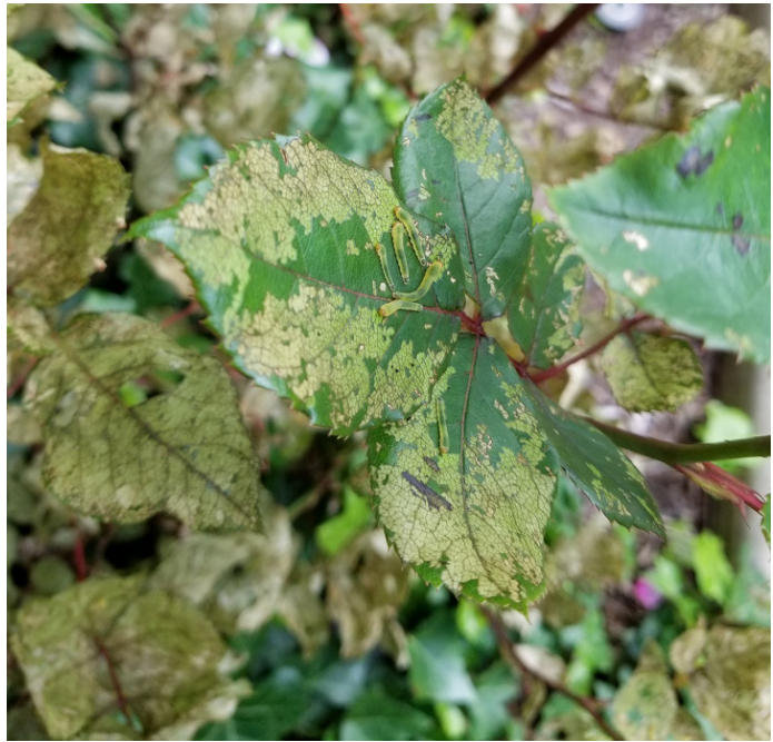
Bristly roseslug sawflies can do major damage to roses