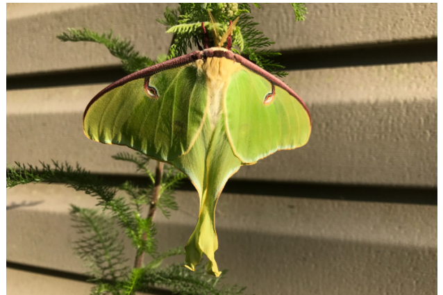
Luna moths have multiple generations per year