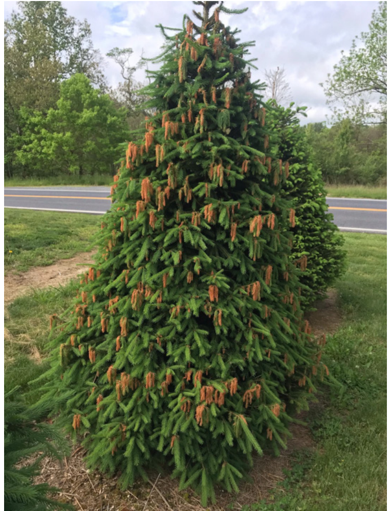
Cold damage on Picea abies