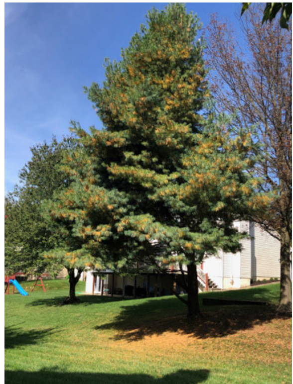
Normal fall color and older needle drop on a white pine