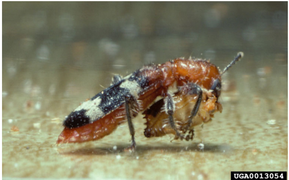
Adult checkered beetle feeding on a bark beetle. Keep that biological control going!

females takes place while females are feeding. Females need lots of energy to produce and develop her eggs. Females of checkered beetles lay their eggs under the bark of trees. Checkered beetles may take anywhere from 1 to 3 years to complete one generation depending on beetle species, prey availability, and temperature. The larvae are predaceous and forage in the galleries of wood boring insects where they feed on bark beetle and other beetle larvae. Some checkered beetles are very voracious feeders, can consume several times their body weight in a day, and are often key players in biological control of wood boring beetles. Since many adult checkered beetles feed on pollen, planting sunflowers and water lilies among other flowering plants support checkered beetles.