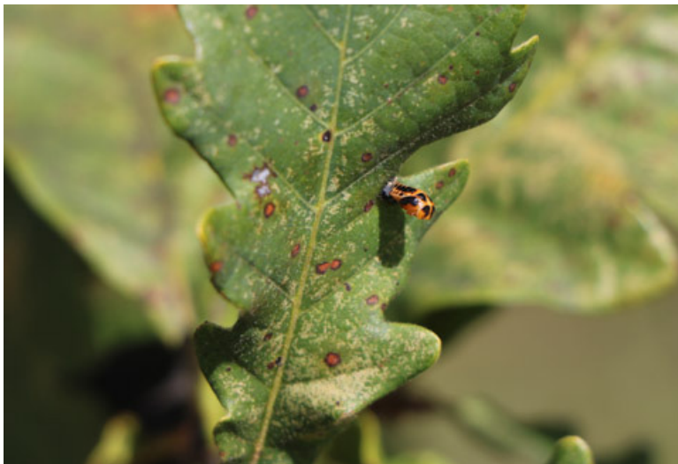
Lady bird beetles feed on lace bugs; this empty lady bird beetle pupal case was on an oak leaf heavily infested with oak lace bugs