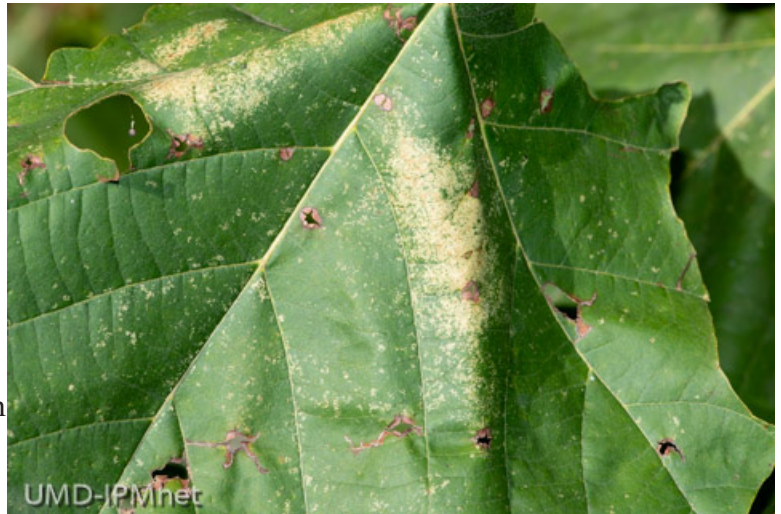
UMD-JPMhet Sycamore lace bug damage on foliage late in the season; this tree is growing in full sun on the edge of our parking lot here at the research center

When a London plane or sycamore is grown in full sun in an exposed location, the sycamore lace bug becomes a rather big deal. The sycamore lace bug, Corythucha ciliata (Say) is a native North American insect that feeds on sycamore trees ( Platanus spp., especially Platanus occidentalis L.). The bugs feed on the undersides of the leaves, initially causing a white stippling that can eventually progress into chlorotic or bronzed foliage and premature senescence of leaves. In cases of severe infestations, trees may be defoliated in late summer.