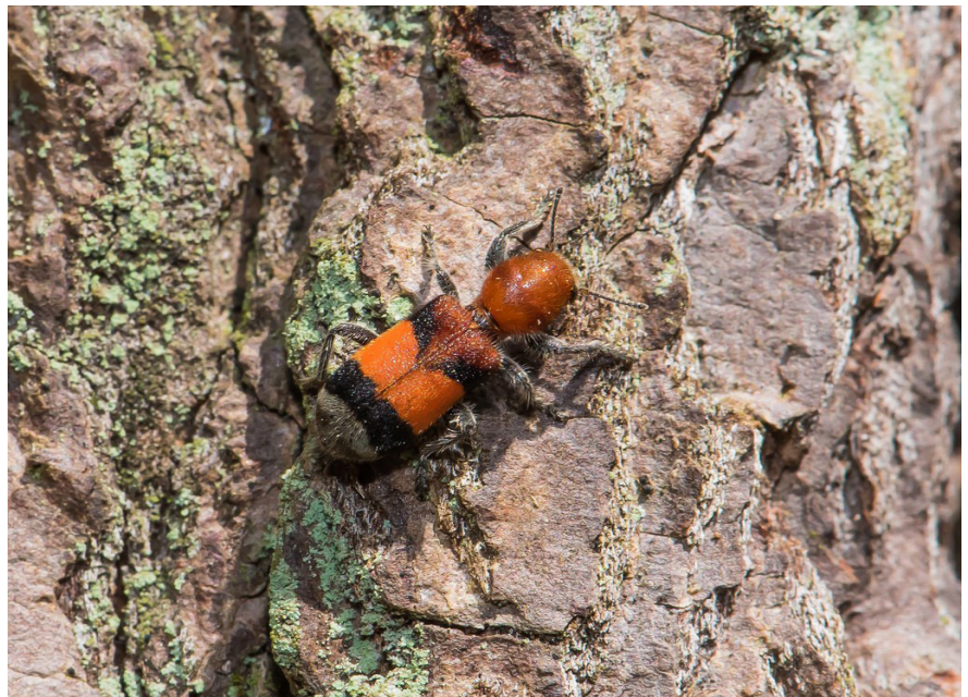
Adult checkered beetle, Enoclerus ichneumoneus , foraging on the bark of a tree.