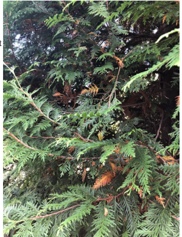
Normal fall color on Arborvitae 'Green Giant'

Todd also reports noticing "that maples that have select limbs with fall color, usually premature, have girdling roots. This Red maple tree shows one particular limb that is very red while the remaining portion of the tree is slowly turning red. I would assume this is a result of the restriction in vascular flow." Stresses, including the dry weather late in the summer, also contribute to the premature fall coloring on the maple.