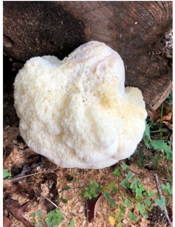
Lion's mane and bearded tooth fungus are several of this cool-looking mushroom's common names

Here is another photo of a cool fungi showing up this fall. It is the lion's mane/bearded tooth fungus, Hericium erinaceus . This mushroom is common on hardwoods, especially oaks and American beech, in late summer and fall.