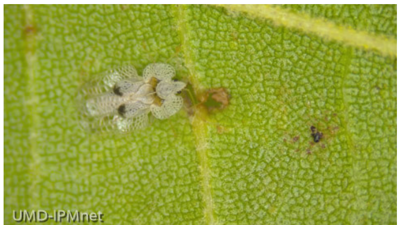
Nymphs and an adult of sycamore lace bug on the underside of a sycamore leaf