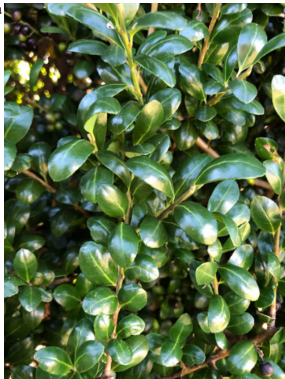
Close-up of the glossy green foliage of Ilex crenata 'Chesapeake'

They can be used as foundation plants, in a hedge or screen, or as a specimen. Once a year, they can be trimmed or sheared to create a soft or a sharply defined plant or hedge. Pests include spider mites, and if the soil is not well drained, black knot of the roots can be problematic.