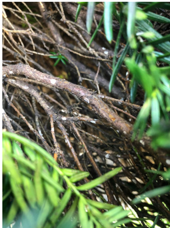
Second instars are the overwintering stage of cottony Taxus/camellia scale