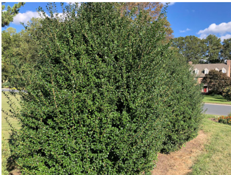
Ilex crenata ‘Chesapeake’ growing in the landscape

Ilex crenata ‘Chesapeake’ or Chesapeake Japanese holly is an evergreen shrub that grows in a dense pyramidal form 6-7 feet tall and 4 feet wide. The glossy, convex, dark green, half-inch leaves grow in an alternate fashion on green to gray-brown stems. All hollies are dioecious, with male plants carrying only fragrant male flowers with stamens and pollen. The female plants are covered with fragrant female flowers in June that mature into dark blue to black berries around September and stay on the plants until the spring. The leaves are often so dense that the berries are often almost hidden, but the native birds have no problem finding them for a food source. Ilex crenata ‘Chesapeake’ is cold hardy from USDA zones 5-9 and thrives in full sun to partial shade, and moist but well drained soils.