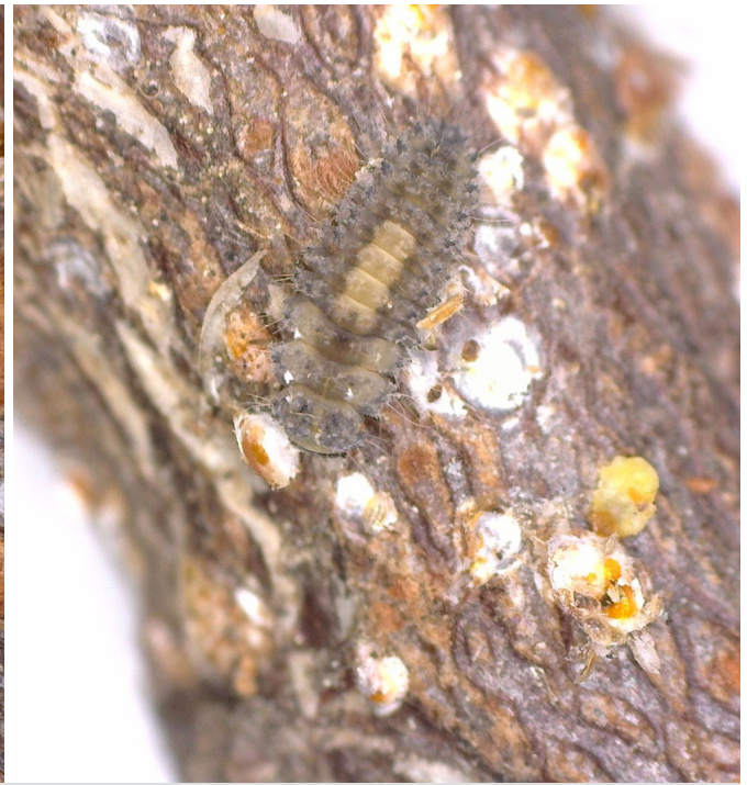
While being viewed under the scope, this lady bird beetle larva was searching for and at times found live scale insects under the covers to eat