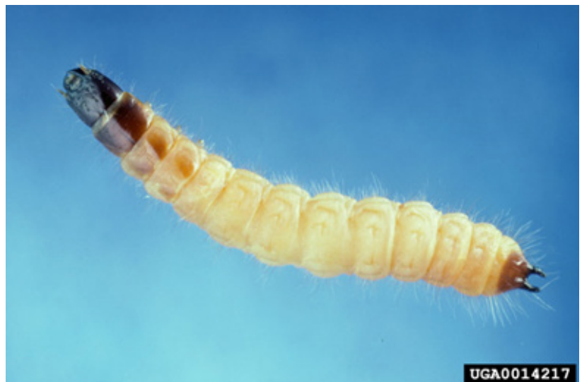
Larval stage of the predacious-checkered beetle often found under bark feeding on boring beetle larvae.

Checkered or Clerid beetles are in the family Cleridae and have a worldwide distribution with over 3,500 species with about 500 species in North America. Checkered beetles can range in size from 3 – 24 mm and are elongate and somewhat flattened in shape, have short bristly hairs, and often brightly colored. Many species are predacious as adults and larvae. Checkered beetles live in a variety of habitats and have diverse feeding preferences. The two major groups of checkered beetles are the “flower visitors” and “tree living species”. “Flower visitors” hang out on flowers (surprise) and feed on pollen and insects that visit flowers. The “tree living species” of checkered beetles are associated with trees where they forage for their prey above and below the bark. The most common food of these checkered beetles are bark beetle and other wood boring beetle larvae and adults. Checkered beetles use pheromones (chemicals used in communication) given off by many wood boring beetles to help them locate their prey. Unfortunately, we have enough bark beetles and other wood boring beetles (ex. emerald ash borer) in our trees to keep predacious-checkered beetles well fed for a long time! Adult checkered beetles tend to feed on adult boring beetles above and below the bark, hence their flattened shaped so they “fit” under the bark. Copulation between males and