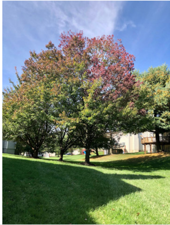
Stresses such as root girdling and drought can cause early fall color on red maple