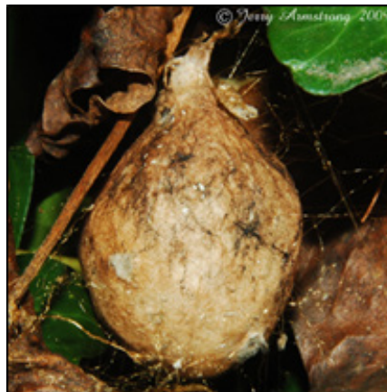
An egg sac of the black and yellow garden spider, Argiope aurantia , is about the size of a ping pong ball