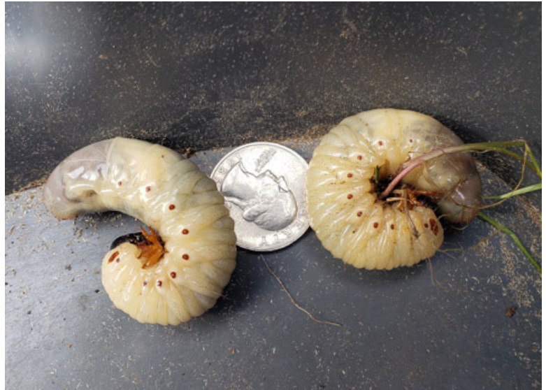
Green June beetles were found in area near where damage from raccoons was found.