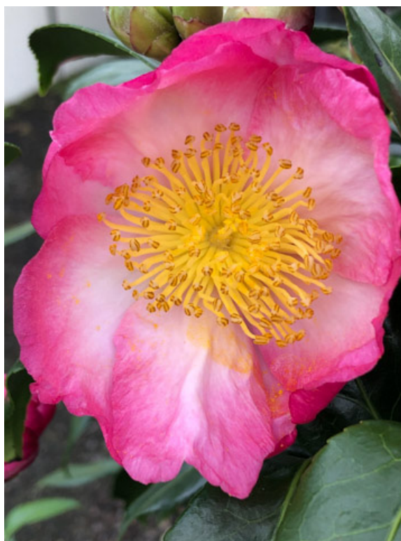
Camellia sasanqua 'Autumn Sunrise' is one of the earliest camellias to bloom in the fall