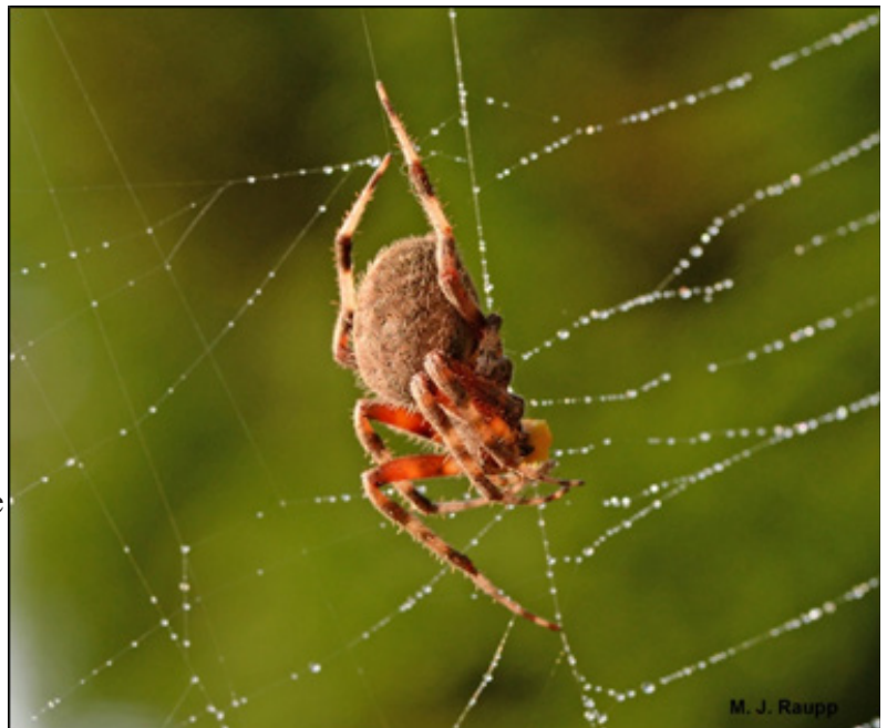
A spotted orb-weaver spider, Neoscona crucifera , hanging head down in her web.