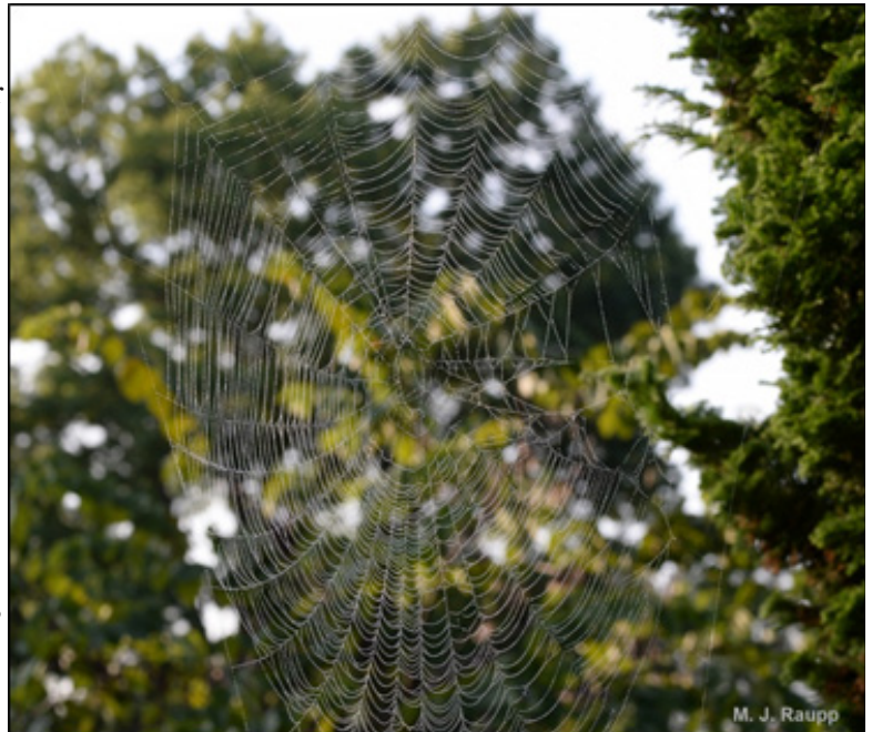
A fine morning mist reveals the beautiful web of an orb-weaver spider.

The marbled and spotted orb weaver have a clever strategy to capture prey while limiting exposure to its own enemies. After constructing it’s amazing web of death, the marbled or spotted orb weaver hides in a retreat near