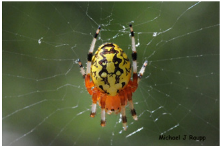
A marbled orb-weaver, Araneus marmoreus , immature sitting within its web.

Once prey are caught in an orb-weaver web, the spider very swiftly approaches the prey, kills it by injecting its venom, and then quickly spins the dead prey wrapping it in silk. The silk comes from spinnerets at the end of the spider's abdomen and the spider uses its legs to maneuver the silk and neatly wrap its dinner. This all happens amazingly fast and is quite exciting to watch! The spider may devour the prey immediately following wrapping or wait and eat it later. Prey include a range of insects such as aphids, flies, bees and wasps, moths, or other flying insects.