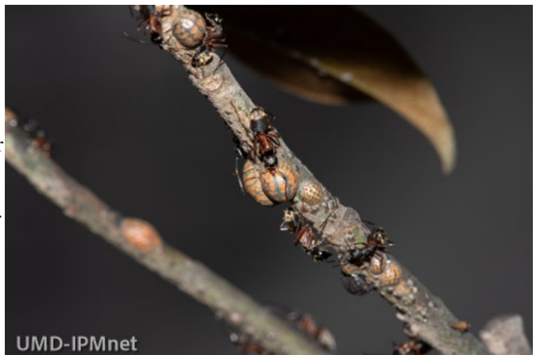
UMD-IPMnet Ants are tending adult females of tuliptree scale that are still producing honeydew on a magnolia here at the research center

If you are seeing tuliptree scale producing honeydew, let me know, along with the location. Flip the female cover over and send in an electronic picture of the female to Sgill@umd.edu .