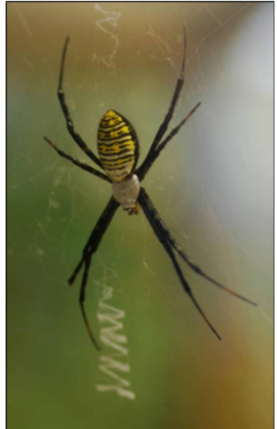
A black and yellow garden spider, Argiope aurantia , in her web waiting for lunch to come along. Note the stabilimentum (zig-zag pattern of thick webbing).