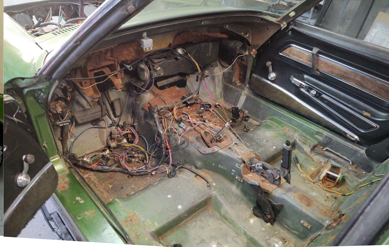
Taking a Deeper Dive