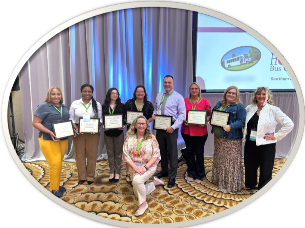
Photo: 2024-2025 Leadership Academy Cohort, Graduation Recognition at the 2025 Annual Conference

QUESTIONS? CONTACT LEADINGAGE MI AT (517) 323-3687