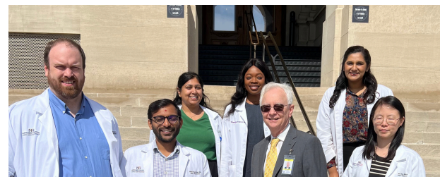
Residents at the Capitol