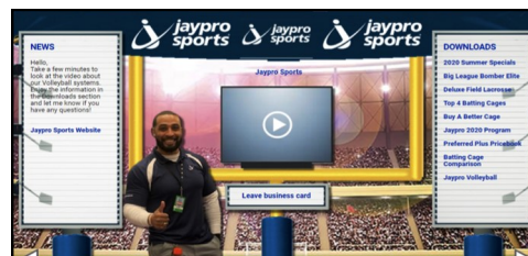
Visit vendor eBooths and win prizes!