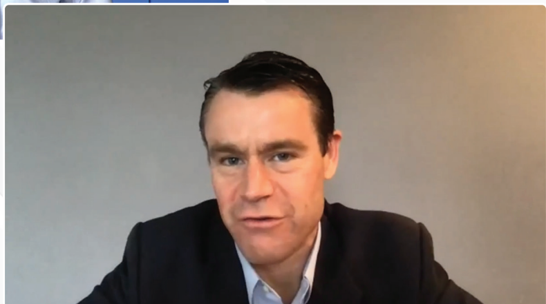
U.S. Senator Todd Young (IN)