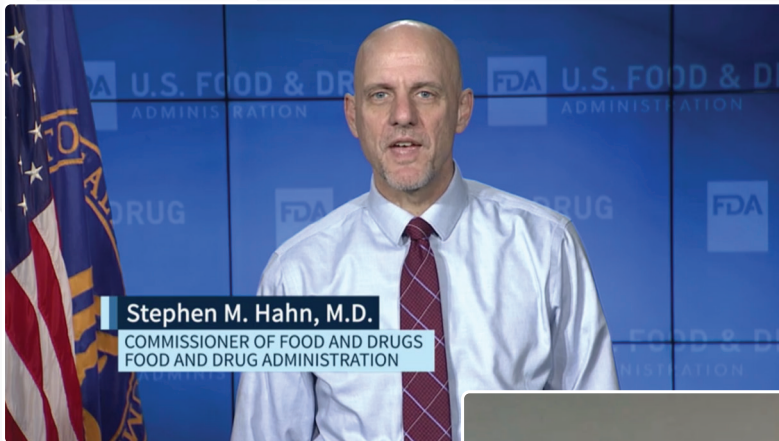
FDA Commissioner Stephen Hahn