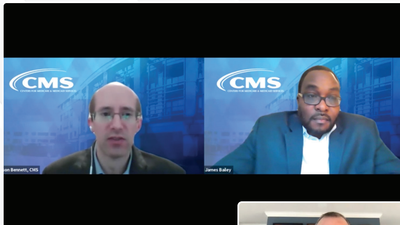
CMS officials answering attendees questions