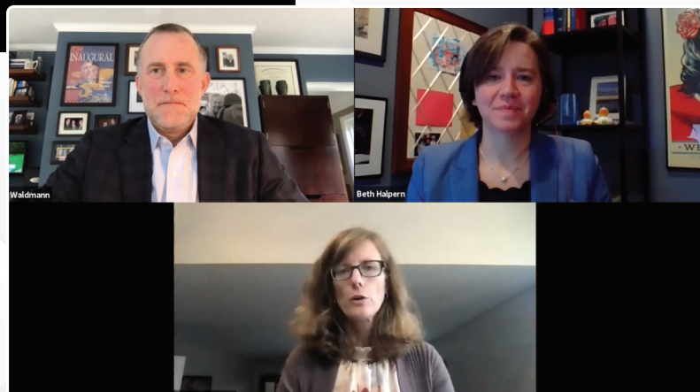
Interactive panels of policy makers and industry experts discuss the latest medtech developments