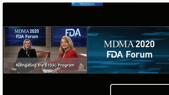
FDA and MDMA Staff Answering Attendees' Virtual Questions

MDMA hosted 12 top FDA officials to address over 130 attendees and answer their questions during this popular two day event. MDMA was able to provide a unique and effective opportunity to share best practices and common challenges as top policy makers, industry executives, regulators and others confronted the growing COVID-19 pandemic.