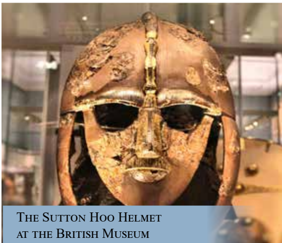
THE SUTTON HOO HELMET AT THE BRITISH MUSEUM

The Medieval Academy of America is a tax-exempt 501(c)3 organization. Gifts are allowable U.S. federal income tax deductions. We encourage you to support the Academy's mission with an online donation: https://MedievalAcademy.org/donations .