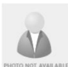
PHOTO NOT AVAILABLE