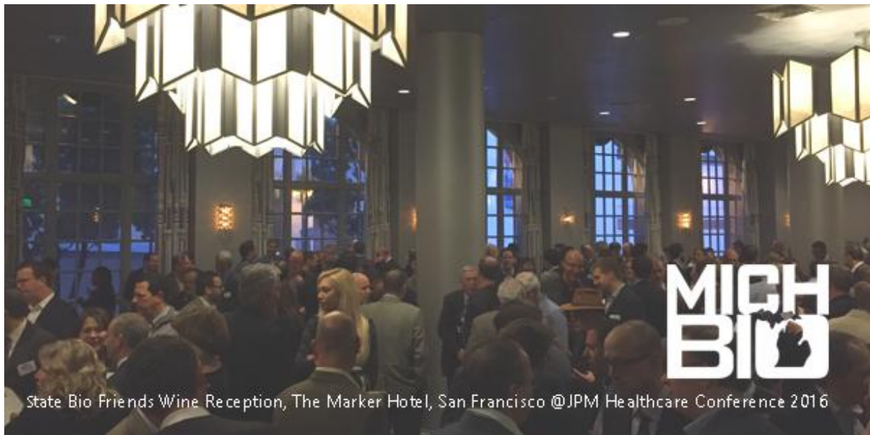
State Bio Friends Wine Reception, The Marker Hotel, San Francisco @JPM Healthcare Conference 2016