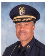
District 13 Chief James E. Craig Detroit