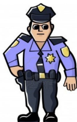
District 3 VACANT