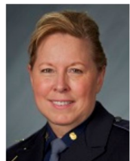
District 14 Col. Kriste Etue Michigan State Police