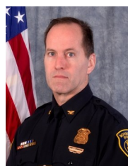
District 2 Chief Corrigan O'Donohue Royal Oak