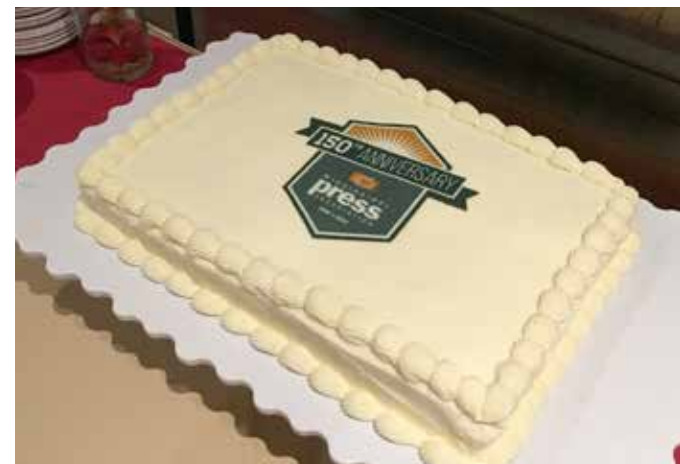
The anniversary cake served over 100 people (because there was more than one).