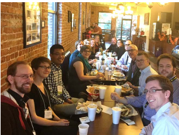
Left: Student meetup during the Midwest Chapter meeting; Right: Several students (and a recent grad) attend sessions during the meeting