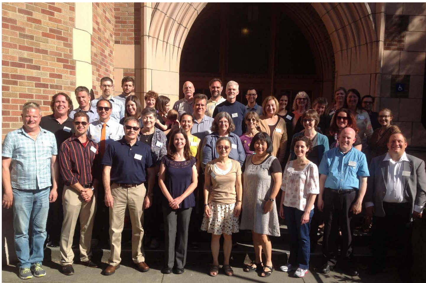
The California and Pacific Northwest Chapters gather for a group photo