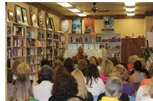
Elin Hilderbrand on her WINTER STREET Tour