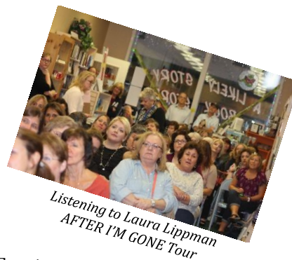
Listening to Laura Lippman AFTER I'M GONE Tour