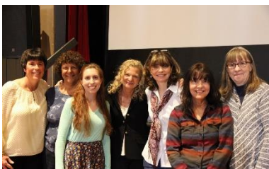
Lisa Scottoline with Bookshop Staff

For in-store events, we can seat as many as 40 people with standing room of 60+.