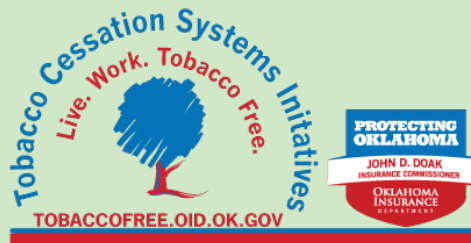
Oklahoma Insurance Department