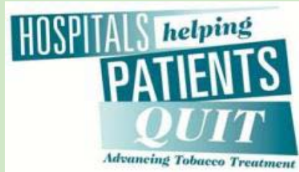
Oklahoma Hospital Association