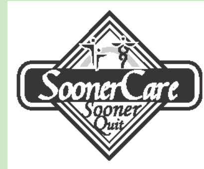
Oklahoma Health Care Authority (Medicaid)